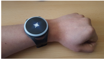
Figure 2: An off-the-shelf wearable haptic device, worn on the wrist, to give rhythmic haptic cue for walking outdoors [13].