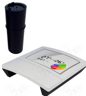
Fig. 1. The SMART_RAD_EN monitoring system.

At present, an intelligent device has been developed in the SMART_RAD_EN project that continuously monitors the concentration of the most frequent and dangerous household pollutants (figure 1).