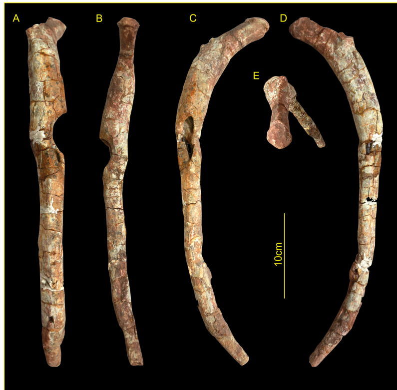
Figure 3. External morphology of the YX V0003 third rib. (A) lateral view; (B) medial view; (C) anterior (cranial) view; (D) posterior (caudal) view; (E) dorsal view. Scale bar is 10 cm.