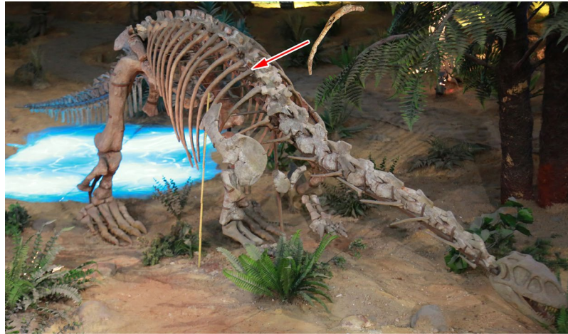
Figure 2. Museum reconstruction of the Lufengosaurus huenei YX V0003 sauropod. Arrow shows the anatomical location of the affected rib.