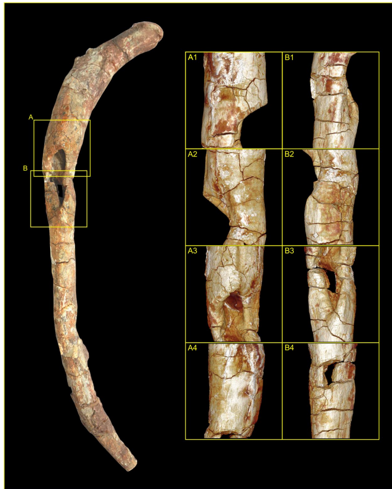
Figure 4. External morphology of the pathological Lufengosaurus huenei sauropod rib reconstructed from surface render of micro-computed tomographic (MCT) image volume. Schematic overlay of the photograph highlights the regions of interest (ROI) based on the respective MCT volumes ROIA and ROIB. Each ROI shows (1) lateral view; (2) medial view; (3) anterior (cranial) view; (4) posterior (caudal) view. Note, the section lines labelled A to F indicate the anatomical locations of MCT orthoslices presented in Fig. 5. Volume renders produced by P.S.R.-Q.

to the formation of the pathological defect. None of the fractures observed across the wider specimen are consistent with peri-mortem trauma or in-vivo failure, and instead present as transverse or right-angled breaks, showing block-comminution between major fracture blocks, and are thus ‘dry bone’ fractures and post-mortem/fossilisation in nature 28,29 . Many of these fracture boundaries have subsequently been infilled with calcite, particularly those following longitudinal split lines along the grain of the rib shaft.