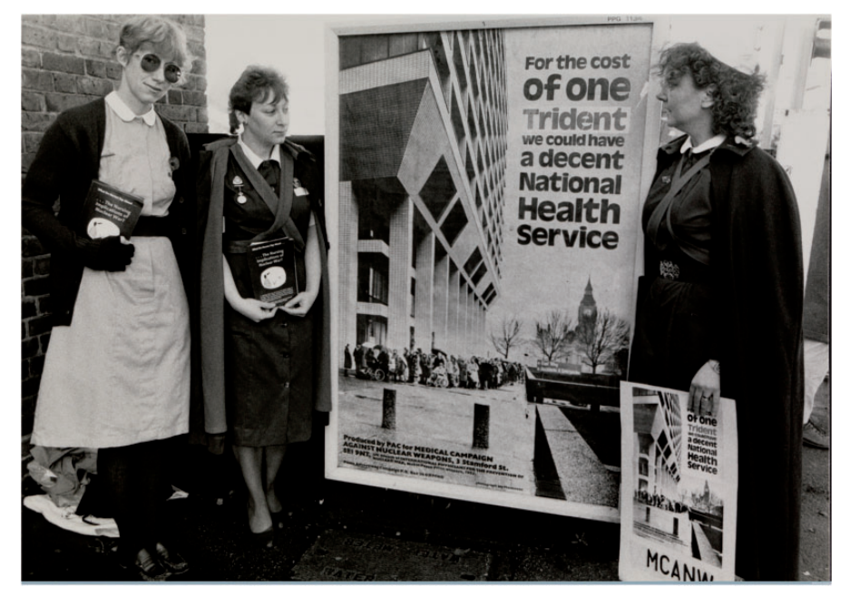
Figure 2: Nurses with 'Treatment Not Trident' re-launch campaign poster.

remained above three million between 1982 and 1986, shifting public attention at times away from nuclear arms.<sup>86</sup> Here, TNT followed in the tradition of sociological and psychological studies of the consequences of unemployment that had emerged during the 1930s world economic crisis.<sup>87</sup> Curiously though, in the wake of the Chernobyl reactor accident in the Soviet Union in April 1986, civilian nuclear energy did not feature predominantly in MCANW's campaigning, let alone TNT.<sup>88</sup>