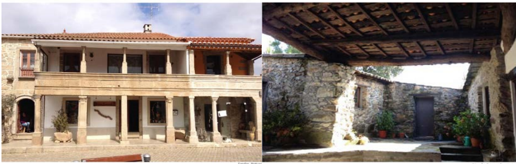
Figure 2. Transition oriented spaces examples.

To prevent solar exposure radiation from heating the glass surfaces and the inertia stone walls (which have widths between 60cm to 1,40m) there are several architectural construction techniques used such as sheds, occlusion devices (shutters) and trees or other types of vegetation. Transition oriented spaces as balconies, porches, arcades and others offer shelter from the meteorological elements when entering or exiting a building, offering “in between” multi-use livable spaces that are the heart of the settlement’s social interactions (Figure 2).