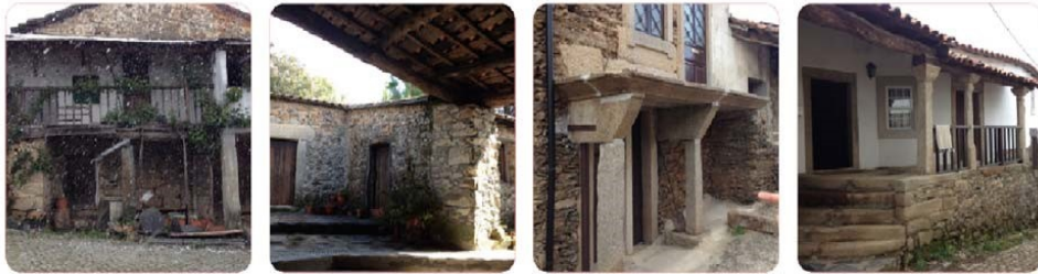
Figure 1. Transition oriented spaces from the cross-border region.

energy is not wanted and solar radiation gain is to be minimized, particularly on the glass surfaces.