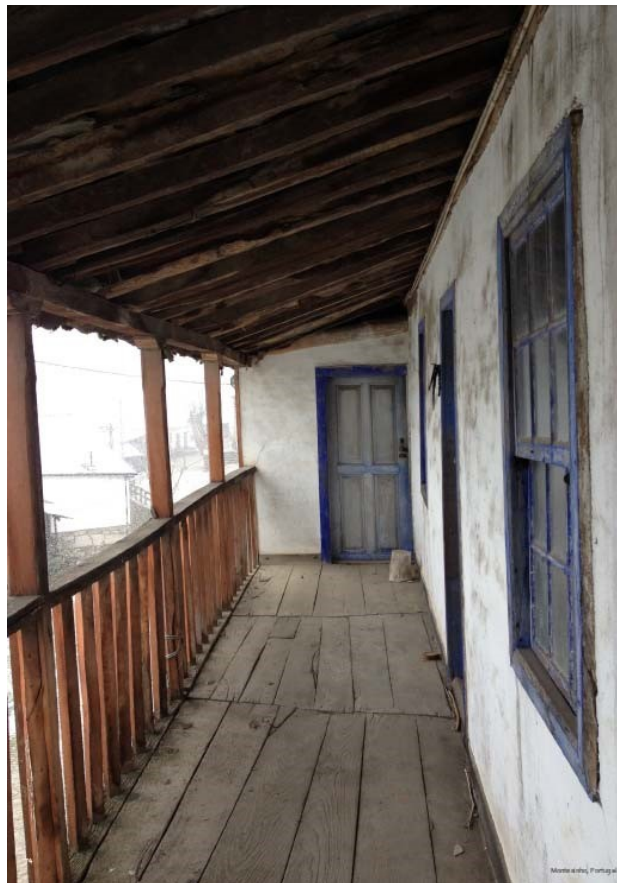
Figure 3. Balcony/horizontal distribution.

When placed on the street level transition spaces provide shelter from wind, rain or snow and when on higher levels they serve as display cabins for “street seeing” and are commonly used when religious events happen or when the village fiestas are celebrated. On summer, these spaces offer a cooler exterior sheltered space where people gather around on the end of the day. Balconies (Figure 3) are an important architectural element as they are responsible for the horizontal distribution, working as an internal/external distribution corridor. Two storey buildings often have no interior stairs which means both horizontal and vertical building’s distribution is made throughout the interior/exterior balconies.