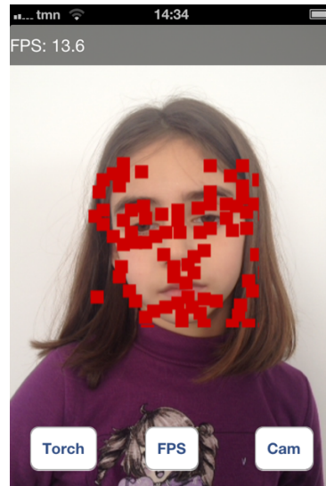
Fig. 2 – Interest points in child's face.

of space and daily routine as well as the type of interactions established. Enabling environment created by the intentional act of kindergarten teachers constitute itself as a key element in the involvement of children. If the observation data indicate that children are not involved, adults should reflect critically about the aspects to improve (Fig. 3).