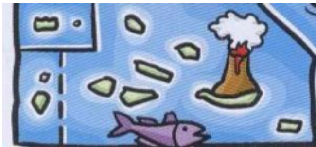
Figure 22 – The island of Azores ( idem ).

The montes alentejanos (or hillocks in Alentejo) are a typical image of Alentejo, south of the Tagus River, which represent a fairly extensive rural estate and its facilities, usually situated at the highest point of a hill or hillock. However, in the last decades, they have gradually been abandoned and purchased by foreigners. Related to these hillocks and Alentejo (though not exclusive of this region), we also have olive trees and their much appreciated product, olive oil. Olea europaea is a species of a small tree native to the coastal areas of the eastern Mediterranean Basin, as well as northern Iran. Its fruit is of major agricultural importance in the Mediterranean region as the source of olive oil. Olive trees are very hardy, drought-disease- and fire-resistant, and can live for a very long time – an olive tree in Algarve is said to be 2,000 years old.