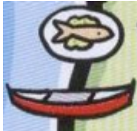
Figure 12 – Ria de Aveiro ( idem ).

The Castro culture developed during the first millennium AC and is related to the appearance of the first populations in Portugal; one of its features was the new set of symbolic representations, mainly masculine figures, intended to glorify heroic ancestors.