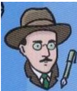
Figure 8 – Fernando Pessoa ( idem ).

is supposed to be based on the fact that when he was coming back from India, where he was sent in exile for having injured a member of the Royal Stables, he was shipwrecked. Because he had already written Os Lusíadas , it is said that he sold one of his eyes to the devil in exchange of saving his masterpiece, and not his Indian lover. Regardless of managing to reach shore without any harm and publish his epic poem, he died in penury.