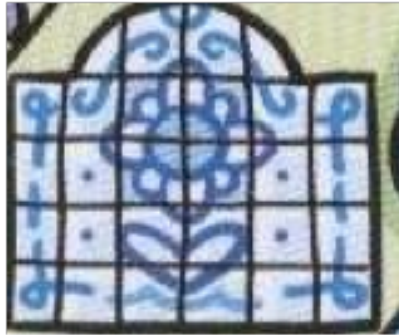
Figure 19 – Azulejos ( idem ).

Azulejos is a Portuguese word that comes from the Arabic word zellige , meaning ‘polished stone’, a form of Portuguese painted, tin-glazed, ceramic tilework that became a typical aspect of our culture and has been produced continuously for 5 centuries. The art of tiling can be found in churches, palaces, ordinary houses, train or subway stations; they are applied on walls, floors and even ceilings as ornamental art, but also for specific functions, such as temperature control.