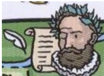
Figure 7 – Luiz de Camões ( idem ).

Nonetheless, the story states that Cristóvão Colombo came to offer his services to the king of Portugal, who refused them and ultimately led him to head for Spain, where his services were accepted. 1494 is a milestone of the Discoveries, because the Tratado de Tordesilhas was signed, which divided the newly-discovered lands outside Europe between Spain and Portugal along a meridian 370 leagues west of the Cape Verde islands.