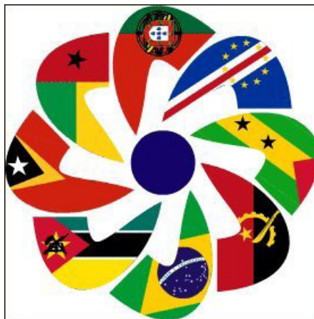
Figure 24 – Representation of the countries which speak Portuguese ( http://www.mundodoscuriosos.com.br ).

Portuguese is officially spoken in Angola, Brazil, Cape Verde, Guinea-Bissau, Equatorial Guinea, Mozambique, Portugal, São Tomé e Príncipe, East Timor and Macau, by around 250 million people, 200 million of which in Brazil only.