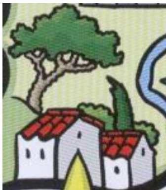
Figure 21 – Olive trees and the montes alentejanos ( idem ).

The montes alentejanos (or hillocks in Alentejo) are a typical image of Alentejo, south of the Tagus River, which represent a fairly extensive rural estate and its facilities, usually situated at the highest point of a hill or hillock. However, in the last decades, they have gradually been abandoned and purchased by foreigners. Related to these hillocks and Alentejo (though not exclusive of this region), we also have olive trees and their much appreciated product, olive oil. Olea europaea is a species of a small tree native to the coastal areas of the eastern Mediterranean Basin, as well as northern Iran. Its fruit is of major agricultural importance in the Mediterranean region as the source of olive oil. Olive trees are very hardy, drought-disease- and fire-resistant, and can live for a very long time – an olive tree in Algarve is said to be 2,000 years old.