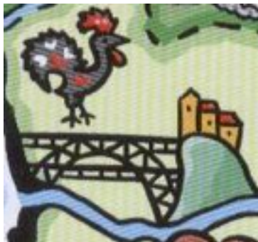
Figure 10 – The rooster of Barcelos and D. Luís Bridge in Porto ( idem ).

These rock art sites comprehend hundreds of carvings from the Upper Paleolithic period to the Magdalenian/ Epipalaeolithic (22,000-8,000 BCE), representing animal figures, namely horses and oxen, whose size range from 15cm to 1.80m. They were found in 1995, at the time of the construction of an EDP (National Electricity Company) dam and was inscribed as UNESCO's WH in 1998.