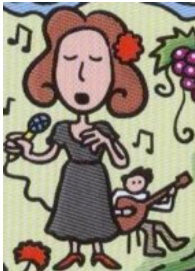
Figure 13 – Fado de Coimbra ( idem ).

Fado means ‘destiny’, ‘doom’ or ‘fortune’, but it also came to designate the type of song that deals with saudade (missing someone and longing or yearning to be with them), love and betrayal. Fado developed in several places and has been used for centuries by university students for their serenades, usually twice a year, at the beginning of the academic year, dedicated to the freshmen, and, at the end, during the Queima das Fitas (the burning of the ribbons, symbolising the end of higher studies).