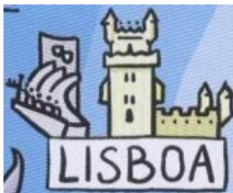
Figure 15 – Padrão dos Descobrimentos ( idem ).

Although, from our viewpoint, fado from Coimbra is the most beautiful one, it is undeniable that Amália Rodrigues must be mentioned. She was born in 1920 and died on 6th October 1999, a day of national mourning, being buried at Panteão Nacional . She is one of the most renowned Portuguese singers, said to be the Queen of Fado and an ambassador of Portugal; she performed everywhere in the world: Chez Carrère (Paris), Ritz (London), Lincoln Centre (New York), Rome, Trieste, Dublin, and the like. It is interesting that she launched her first LP in the USA in 1954 by Angel Records, at a time when women were forbidden to travel without their husbands, let alone if they were single. Listen to one of her most beautiful fados “Com que voz” (see References and its translation in Annexes). One of the most pungent criticisms was that she embodied the 3 Fs of the dictatorship: fado , Fátima (the sanctuary) and football. Nevertheless, we believe that one cannot be held responsible for being turned into a symbol and incorporated into the regime’s propaganda.