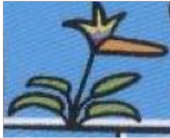
Figure 23 – Bird of Paradise ( idem ).

agriculture, dairy farming (cheese and butter products), minor livestock ranching, fishing and tourism.