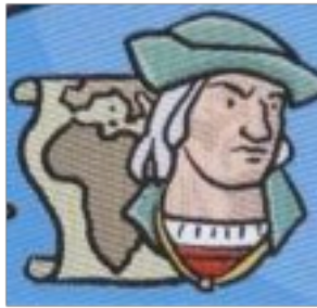
Figure 3 – Diogo Cão ( idem ).

Infante D. Henriques was the junior prince of the Kingdom of Portugal and an important figure in the early days of the Discoveries. He was the third child of King João I, the founder of the Avis dynasty and he himself encouraged his father to conquer Ceuta in 1415 and other lands down to Cabo Bojador. According to Gomes Eanes de Zurara, in his Chronicles about the deeds in Guinea (“ Crónicas dos feitos da Guiné ”), Henry is described as having no luxuries, speaking with soft words and calm gestures, a man of many virtues that never allowed any poor person to leave his presence empty-handed.