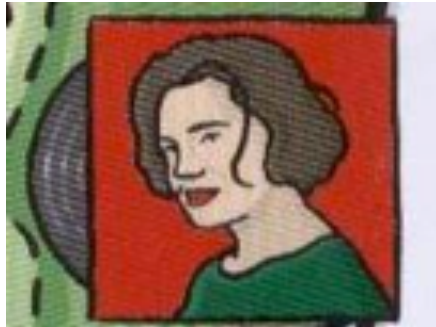
Figure 14 – Amália Rodrigues ( idem ).

Although, from our viewpoint, fado from Coimbra is the most beautiful one, it is undeniable that Amália Rodrigues must be mentioned. She was born in 1920 and died on 6th October 1999, a day of national mourning, being buried at Panteão Nacional . She is one of the most renowned Portuguese singers, said to be the Queen of Fado and an ambassador of Portugal; she performed everywhere in the world: Chez Carrère (Paris), Ritz (London), Lincoln Centre (New York), Rome, Trieste, Dublin, and the like. It is interesting that she launched her first LP in the USA in 1954 by Angel Records, at a time when women were forbidden to travel without their husbands, let alone if they were single. Listen to one of her most beautiful fados “Com que voz” (see References and its translation in Annexes). One of the most pungent criticisms was that she embodied the 3 Fs of the dictatorship: fado , Fátima (the sanctuary) and football. Nevertheless, we believe that one cannot be held responsible for being turned into a symbol and incorporated into the regime’s propaganda.