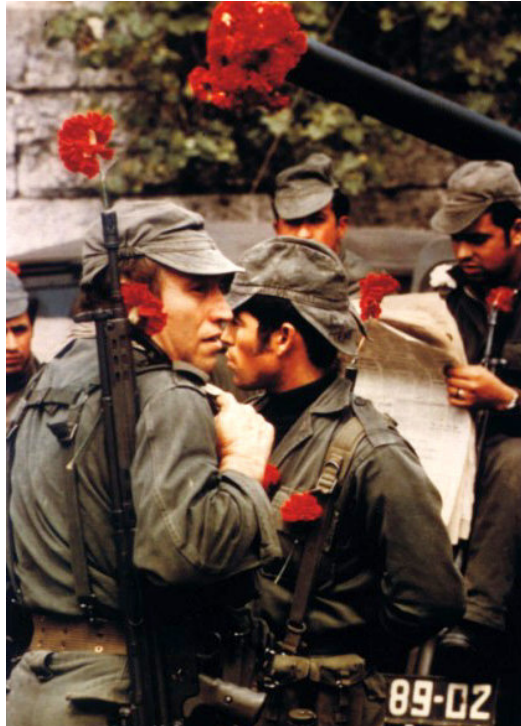
Figure 18 – The military wearing carnations on 24th April 1974 ( http://www.encyclopedia.com.pt/articles.php?article_id=1094 ).

The coup was carried out by the armed forces, the military that mainly belonged to the intermediate hierarchy, called the captains, most of whom had participated in the colonial wars. Initially, it was related to corporative demands of the military, although later it comprehended political concerns as well. After the fall of the dictatorship, a Junta de Salvação Nacional (Council for National Salvation) was created and a period of intense turmoil followed: the so-called PREC (undergoing revolutionary process) was marked by demonstrations, occupations, provisional governments and nationalisations, which ended on 25th November 1975. This period of political and social unrest is also known as the hot summer of 1975. Our current constitution was approved in 1976, after a long way since the Constitutional Charter from 1822.