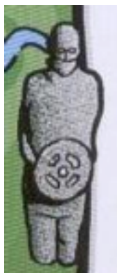
Figure 11 – Warriors castrejos (idem).

Port Wine is obviously of inescapable mention, since it is 1st protected designation of origin in Portugal, provided by Marquês de Pombal in 1756 and either 1st or 2nd in the world. The Roman invasions, first in 1st century BC and then in 3rd century AC, introduced the culture of vines. In 1211, King Afonso II forbade the cutting of vineyards because they were considered possessions of the kingdom; in 14th century, wine was already the largest piece of Portuguese exportations, assessed in about 1£m. In 17th century, a privileged relationship with the British was born: Sandeman, Offley, Hunt, Newman, Roope, Campbell, Bowden & Taylor, Croft became well-know because of producing and trading in Port Wine. The micro-climate of the region characterised as hilly and the long and dry autumns and short winters also allowed the fields to become fertile places for experiments and the development of vineyards, the so-called 'generous wine'. Later, in 1756, the Companhia Geral da Agricultura das Vinhas do Alto Douro (the General Company of the Agriculture of Vineyards of Douro Alto) was created. Now the Região Vinhateira do Alto Douro or Alto Douro Vinhateiro (Alto Douro Wine Region) includes 26,000 acres and was classified as UNESCO's WH in 2001 within the category of cultural landscape.