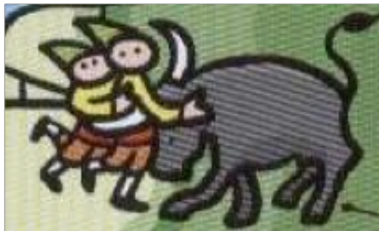
Figure 20 – Bullfights and taking the face ( idem ).

Azulejos is a Portuguese word that comes from the Arabic word zellige , meaning ‘polished stone’, a form of Portuguese painted, tin-glazed, ceramic tilework that became a typical aspect of our culture and has been produced continuously for 5 centuries. The art of tiling can be found in churches, palaces, ordinary houses, train or subway stations; they are applied on walls, floors and even ceilings as ornamental art, but also for specific functions, such as temperature control.