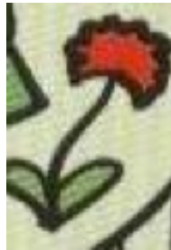
Figure 17 – Carnations and the Carnation Revolution (idem).

Torre de Vasco da Gama is a 145-m lattice tower, named after the Portuguese explorer Vasco da Gama, whose steel structure represents the sail of a caravel. At the height of 120m, there was an observation deck and a luxury panoramic restaurant. While it was still open, it was the tallest structure in Portugal open to the public. On the right of this tower, we have the Vasco da Gama Bridge, a cable-stayed bridge, flanked by viaducts and range views, that spans the River Tejo. It's the longest bridge in Europe, and the ninth longest in the world, with a total length of 17.2km. It was opened on 29th March 1998, in time of the opening of Expo'98 and the 500th anniversary of Infante D. Henriques.