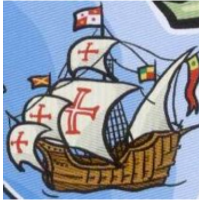
Figure 6 – Spanish caravels ( idem ).

The fact that there are Spanish items amidst Portugal's symbols and icons can be interpreted in two different ways: the intertwining of the history of Portugal and Spain throughout the centuries, as mentioned above, namely when concerned with the Discoveries, as well as some blurred misconceptions from the authors towards what is specifically Portuguese and Spanish.