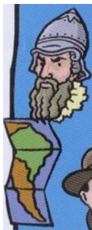
Figure 5 – Pedro Álvares Cabral (idem).

These two representations of Vasco da Gama match the paintings in which he was portrayed in the 15th century and onwards, with these two different types of hats, bearing the world behind him. Vasco da Gama was the commander of the first ships to sail directly from Europe to India, through the Cape, Mombasa, Malindi and then Calicut, and he was also responsible for Portugal's success as an early colonising power.