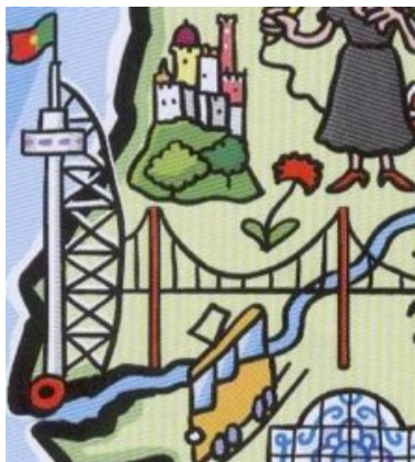
Figure 16 – Torre de Vasco da Gama at Expo'98 ( idem ).

On the right of the Padrão , we can see the Torre de Belém (Belém Tower or Tower of St. Vincent). It was built in the early 16th century from limestone and is a prominent example of the Portuguese Manueline style or late Portuguese Gothic. The tower was commissioned by King João I as a defence system at the mouth of the river and a ceremonial gateway to Lisbon. It is composed of a bastion and a 30-metre four-storey fortified tower located in Belém. This district in Lisbon, Belém, played a significant role in the era of the Discoveries, and it is currently the presidency headquarters. It became UNESCO's WH since 1983, along with the Mosteiro dos Jerónimos (Hieronymites Monastery). This hermitage place was founded by Infante D. Henrique, the Navigator, in 1450, and this was where Vasco da Gama and his men spent the night in prayer before departing for India in 1497. Its construction started by order of King Manuel I (1502) to commemorate Vasco da Gama's successful return from India.