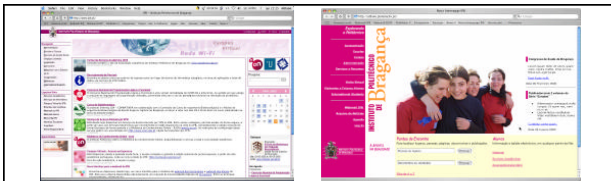
Figure 2. Left, present site homepage. Right, prototype homepage.

At the homepage level images that could adequately express the unique reality of the institution were utilized, given the interest to transmit at first contact the impression of warmth and friendliness. The expression of the reality and resources of the IPB was devised under the shape of multimedia contents.