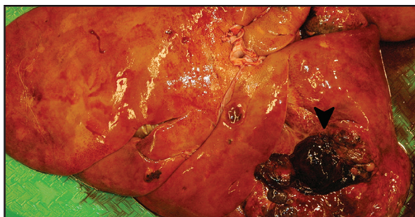
Fig. 2. Gross necropsy: liver tumours in an Asiatic lion with haemangiosarcoma.

labelled strongly positive for vWf and CD31 (Fig. 3b). In the lung similar neoplastic foci were observed, which also labelled positive for vWf and CD31. There was mild fibrosis of the renal capsule. There were no neoplastic lesions in the kidney. The capsule of the spleen showed focal mesothelial cell proliferation without signs of neoplastic masses in the spleen. In the bronchial lymph node, and especially in its subcapsular sinuses, there was a multifocal mild infiltration of macrophages. Many of those macrophages had an intracytoplasmic accumulation of a yellowish-brown granular pigment. Prussian blue staining confirmed the pigment as haemosiderin. Other macrophages showed erythrophagocytosis. The lesion in the humerus, detected during the preparation of the skeleton, was not examined histopathologically.