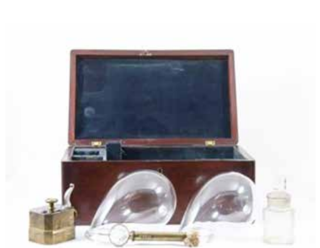
Figure 2. Glass cupping set of Dr. Fox from around 1850 (Anonymous, 2015).

Negative pressure wound therapy appears a promising technique for the treatment of complicated wounds. Negative pressure wound therapy has a history of research and development (Figure 3), but further research is necessary to optimize the technique and its applications in practice, both in human and veterinary medicine. One of the difficulties of comparing the existing literature on NPWT is that outcome measures of NPWT are different, which contribute to reported con-