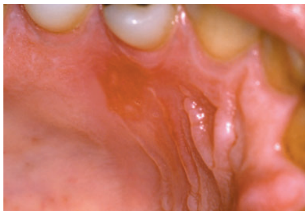
Figure 2 Regenerative patch at the frontal slope of the palate, indicative of recurrent grazing as a symptom of increased mucosal fragility, presenting in a patient with Ehlers–Danlos syndromes (EDS) hypermobility type (former EDS III).

No abnormalities in tooth number were recorded in EDS population. Demarcated enamel opacities were found in 9.7% of EDS population. These defects exclusively presented in permanent premolars and could be related to caries experience in the deciduous dentition (local infectious aetiology). No abnormal tooth crown morphology was recorded. Root deformity was recorded in 6.5% of overall EDS population. The presence of