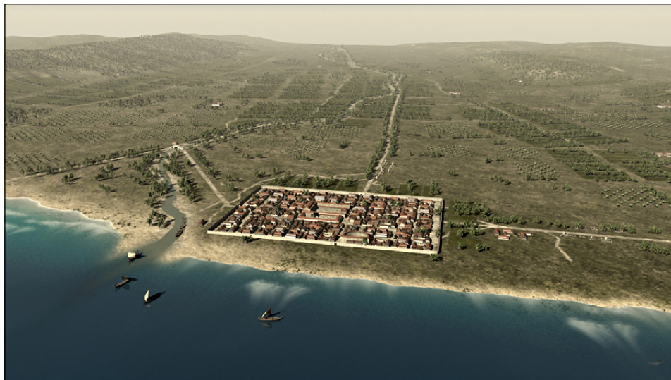
Fig. 3 – Visualization of the early Imperial phase of the Roman town of Potentia and its hinterland near the central Adriatic coast. Elaboration: M. Klein and F. Vermeulen.