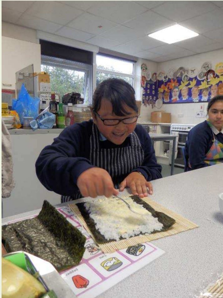
Food tech – making sushi