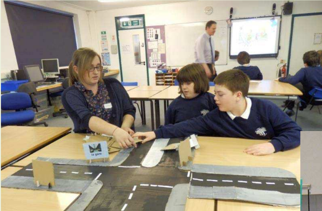
Geography – town planning