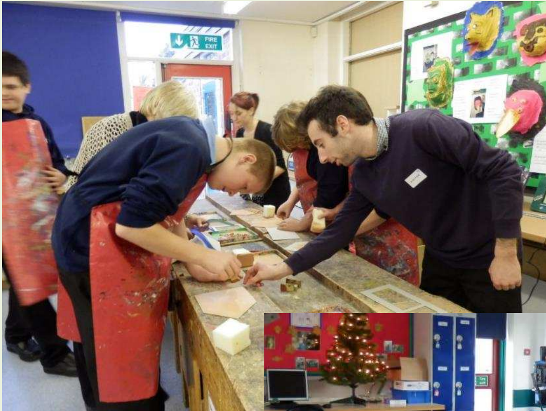
DT – making houses