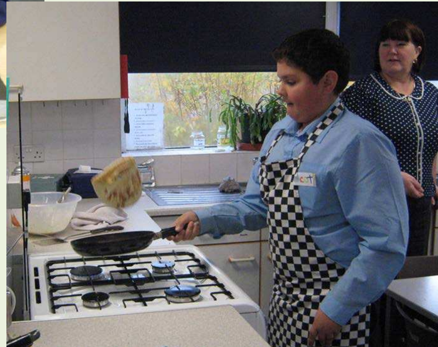
Food tech – making and eating crêpes