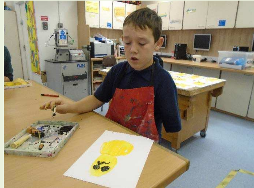
Art – drawing Pokémon