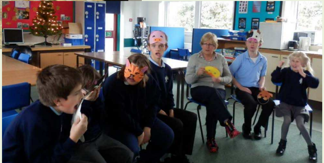
Drama - animals