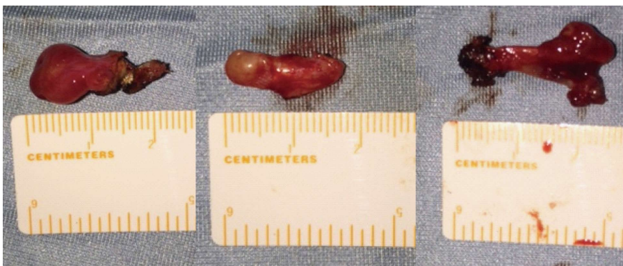
Figure 3 Macroscopic aspect of exostosis.

carpals, phalanges are involved [1] . Costal exostoses may be difficult to recognize on the chest using only X-ray and the chest CT scan is usually suitable [3-5] . Malignant transformation is seen in 0.5%-5% cases of MHE. Axial sites as ribs, spine, pelvic hips and shoulder are sites of increased risk of malignant transformation. Average age at malignant transformation in MHE is 25-30. It is rare before 20 years of age.