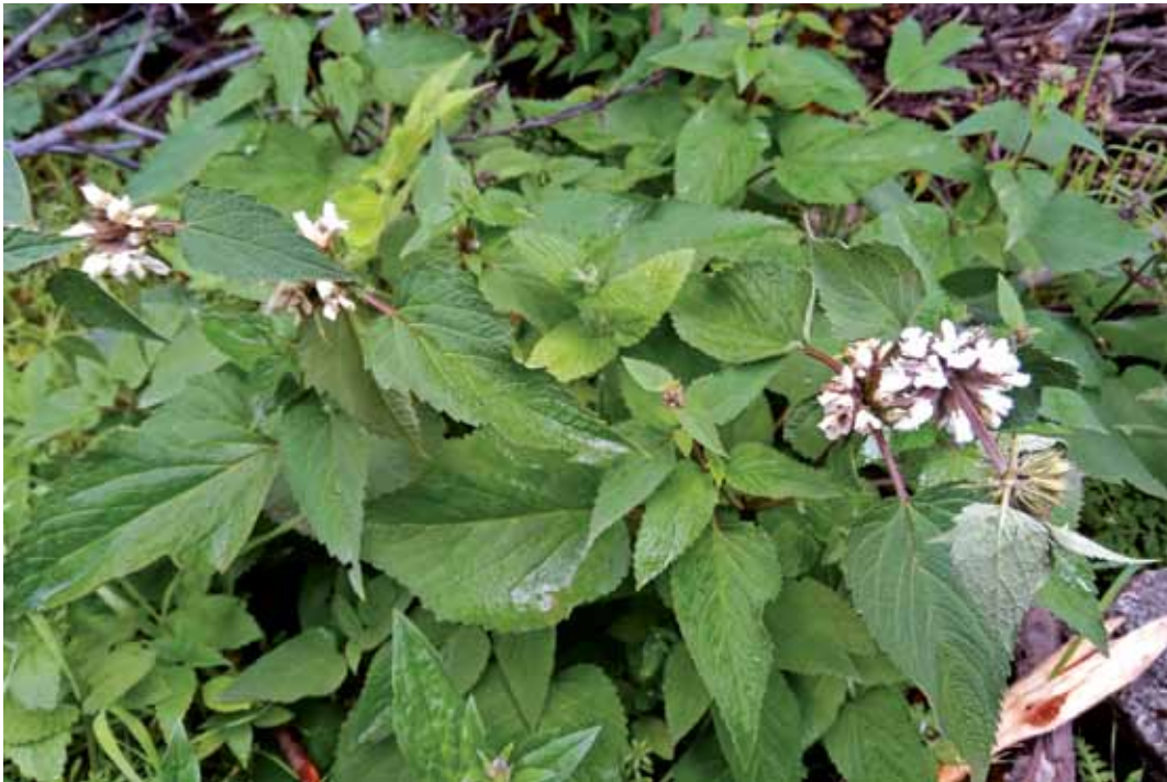
Fig. 9 – The likely larval host-plant of both Lamiogethes forcipenis sp. n., and L. convexistrigosus sp. n., Phlomoides umbrosa (Turczaninow) (Lamiaceae) from Sichuan, Xiangcheng County.

Phenology. The large series of available specimens was collected in middle June (Sichuan) and between end of