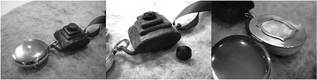
Figure 3 Daguerre.

the engagement with transience. For some, the piece could be about letting go—but of the weight or burden of grieving; being set free of such burdens might give way to a lightness. For others, the locket might offer opportunity to become more comfortable with change. Of course, for some people, the functionality of this locket would cause distress, and a very particular kind of decision-making would be taking place in choosing to place images in this locket. We imagined that this choice would only be made by the owner of the locket for themselves.