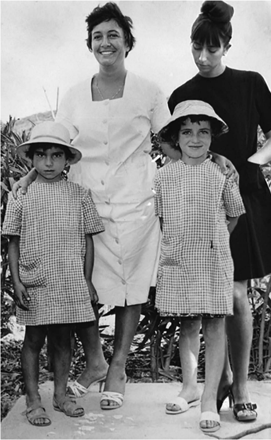
Figure 5 (left) Mamma con maestra , "20.12.53 – 10.08.04," 2004–2014. Image courtesy of the artist. ©Moirá Ricci.