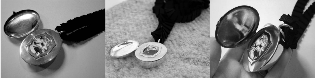
Figure 1 Remember.

artifacts (e.g., jewelry) for others in preparation of dying, and using memento mori to “make more sense of the loss of an individual by turning the experience of death into a didactic tableau.” 10 Such practices suggest an acceptance of mortality, and objects like the Cadet-Picard “laughing skull pin” and memento mori depicting dancing skeletons suggest a subversion of the fear of death through humor. 11 Furthermore, in being steeped in a culture that engaged very openly with mortality, people found intricate ways to continue their relationships with the deceased and used objects such as mourning jewelry and memento mori to “sense-make” in relation to their bereavement and their own mortality.