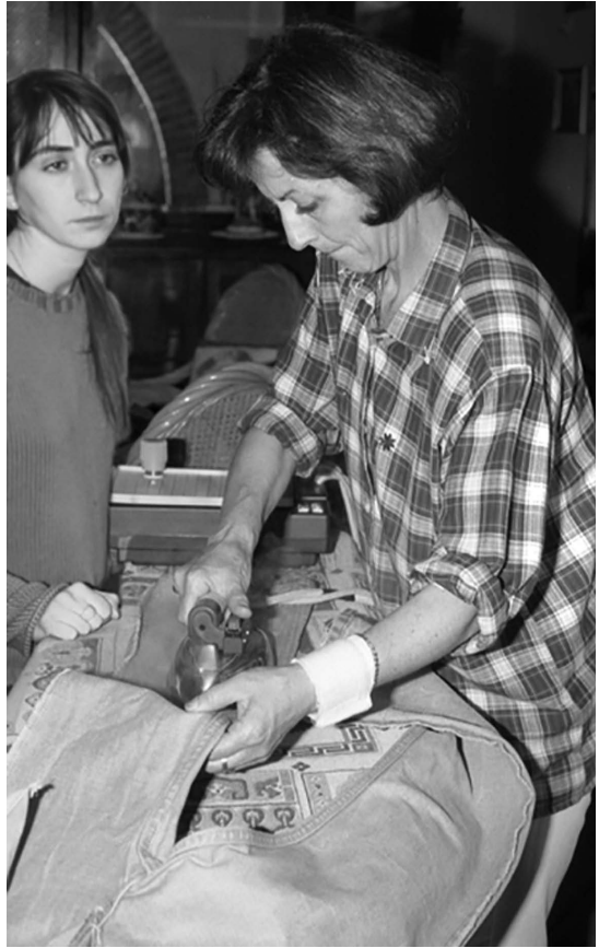
Figure 6 (right) Mamma stira , "20.12.53 – 10.08.04," 2004–2014.

and Nickman highlight the potential for bereavement to be seen as a continuing process of negotiation and meaning making—something fluid that changes as feelings for the deceased periodically lessen or intensify over time. 35 What this framing gives us is an invitation to see grief and bereavement not primarily as a loss, over which we have very little control, but as a space in which to actively sense-make and to build ways to have an ongoing and active relationship with the deceased. The work of Moira Ricci, an artist photographer, speaks very pertinently to this framing.