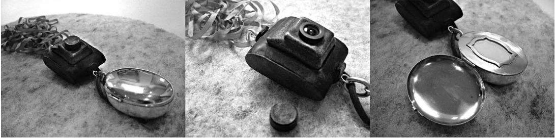
Figure 4 Orpheus.

Each of these characteristics offers particular dynamics for acts of mourning, contemplation of mortality, and the notion of digital dwelling. We posit a perceived preciousness to the image held in Daguerre because of its uniqueness, which could echo the finite and limited nature of mortality. Furthermore, this singularity could be emphasized by the fragility of the image: When the lens cap is removed, another image would take the place of the previous one. The singularity of a digital image is contrary to our common associations of digital materials, which we suggest could be a contemporary “way in” to meditations on the finite elements of life for people in our time. Through each of these features, the digital is drawn into the heart of the intrinsic materiality and historical use of the locket—something that is uncommon for the digital to portray in our contemporary culture.