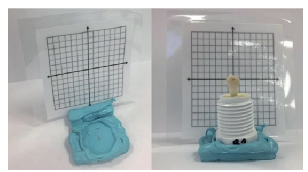
Fig. 1: Mounting jig for standardization of 45° rotational movement.

Group 2: Rotation Group: The bracket was positioned on the center of the tooth with the archwire slot 45 degrees counter clockwise to the tooth long axis measured with a mounting jig (Fig. 1). Uniform force of 300g was