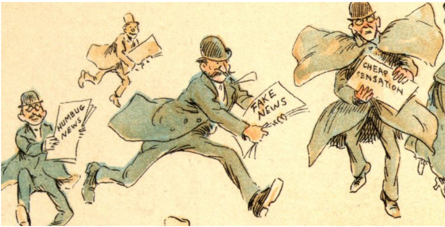
Puck magazine illustration by Frederick Burr Opper, 1894. Wikimedia Creative Commons.