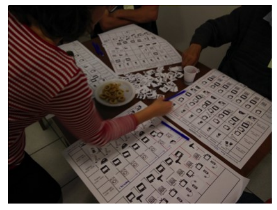
Figure 2 Participants to a workshop expliciting their weekly energy practices, May 2015

participants were expressing the need to see the first of the five conditions described by Dietz et al implemented [4]: the monitoring of the energy and its use. From the ICTs point of