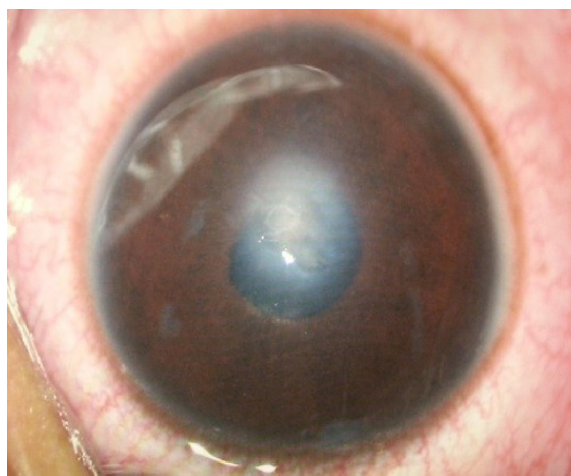
Figure 2 Right eye showing full thickness corneal laceration wound centrally with fibrin clumps in the anterior chamber located superotemporally.

He was then diagnosed as having a right eye full-thickness corneal laceration wound with severe traumatic uveitis secondary to trauma. He underwent right eye examination under general anesthesia, and the corneal laceration was repaired with 10/0 nylon sutures.