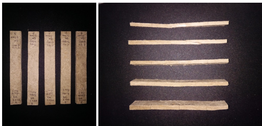
Plate 4. The condition of the specimens before and after the tensile test.

The dried sample material has to be cut to specific size for measuring the tensile strength at the Instron machine. The study was conducted on a universal testing machine (Instron) under axial loading. Averages of three measurements were taken for each specimen pieces of fibres. Samples of fibre pieces are placed carefully in the middle of the cross-head with its end facing exactly perpendicular to the longitudinal axis to obtain accurate results. This process is usually carried out at crosshead speed of 2mm/min continuously (Verma, Chariar & Purohit 2012). The specimen was installed and adjusted properly in the test frame. Hydraulic clutch has been used to hold the test specimen. Stress-strain curves were generated for each test specimen. The test is performed to measure the force required to break the specimen of bamboo fibres compared with banana fibres and the extent to which the specimen stretches or extended to the breaking point. Plate 4 below shows the pieces of broken fibre sheet specimens during tensile test.