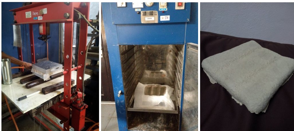
Plate 3. Fibres are compressed and proceeded through the drying process.

Plate 2, shows a picture of how the provision of an aluminium mold from 3D software to the milling machines for fabrication. On the right are pictures of the result from the fabrication process. Through holes were drilled for the purpose of draining the excess fluid and this also to facilitate the process of drying.