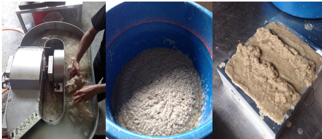
Plate 1. The preparation of fine fibres for molding process.

Each type of fibres will be obtained through the same process starting with crashing banana stem and bamboo culm into pieces separately. Then the chopped banana stem and bamboo will be soaked in a separate container with water in order to make it softer. A holander beater machine was used to prepare fine fibres as how as the handmade papers are made. The process of refining one kilogram of fibres will take about three to four hours.