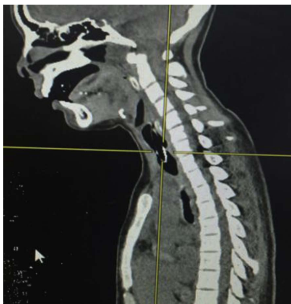
Fig. 2. CT Thorax pre intervention, Sagittal plane: Trachea narrowing 4.6 cm from hyoid bone, 0.8 cm length and 9.5 cm from hyoid bone, 8.7cm length. Right main bronchus narrowest diameter was 0.3 cm.

We report a rare case of tracheobronchial stenosis secondary to