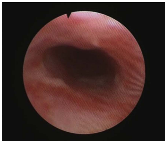
Fig. 1. Day 1- FNPLS showing evidence of subglottic stenosis.

antibiotics, and a salbutamol infusion. As her bronchospasm was not responding, ED team decided for intubation. Multiple attempts at intubation at ED before an alert to ICU was made, as although the larynx was visualized as Cormack-Lehane I, they were unable to advance the Endotracheal Tube (ETT) beyond more than 1 cm past the vocal cord. Finally, she was intubated with ETT size 6.0mm Internal Diameter where cuff was just after the vocal cord and anchored at 16 cm. We had difficulty ventilating her as her peak airway pressure's was persistently high with severe respiratory acidosis.