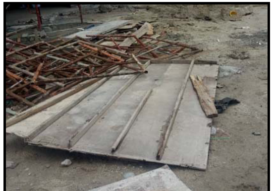
Figure 6: Timber formwork abandoned to the side

Considering the total quantity of timber involved, only 30% was reused. The remaining timber materials were exported to other sites for continued usage. Human error, redesigning of work and unavoidable damages were regarded as the most prominent causes of this waste. One example found on the site was the incorrect erection of a wall. The wrongly-built box up wall underwent alternations such as hacking by workers in order to comply with the approved blueprints.