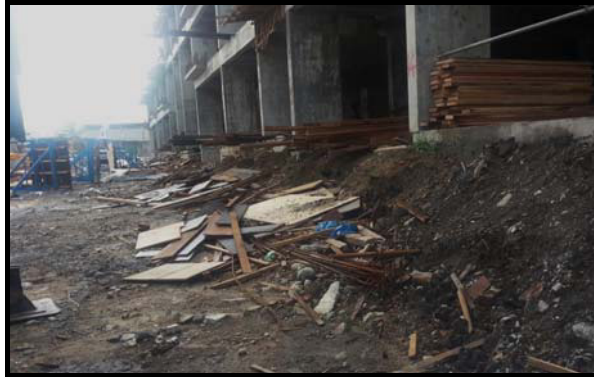
Figure 2: Unwanted materials scattered on the ground near the building.

The overall condition of the site was observed through an interview with the Senior Project Manager, Mr. Ooi Hock San, and a site walk-through led by QAQC Officer, Mr. Mohd Faidhi Faqih Bin Qukri. There were three disposal bins prepared at the site for the collection of discarded materials. Any unwanted materials were collected and discarded into the skid bin. At the time, the most discarded materials were timber because the building was in the building stage which required large amounts of timber to be used as the formwork. The concrete casting workers and formwork cutting workers handled the timber from the production of the formwork till the installation to the structure. Then, leftover, used timber would be modified and reused for similar procedures.