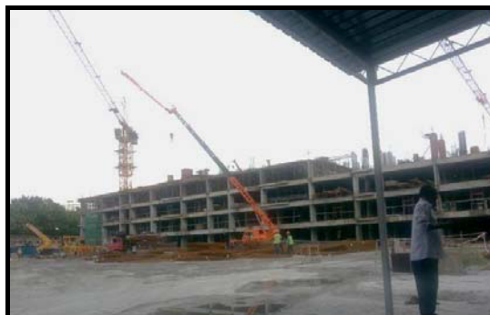
Figure 1: Façade of the multi-storey, residential building at Site A, located at Jelutong, Penang

Located at Jelutong, George Town, Site A was a construction project for mixed development to build 3-storey shop houses and two blocks of multi-storey buildings for medium-cost housing on a podium car park (Figure 1). The building has been under construction for half a year and is expected to achieve a gold rating on the Green Building Index (GBI).