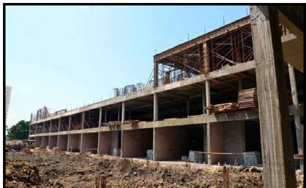
Figure 4: The progress of a 5-storey office suite block