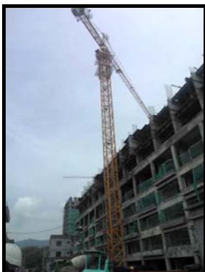
Figure 3: Construction at Site B

Site B was a mixed development project involving the erection of a multi-storey condominium block (Figure 3) and shop houses (Figure 4) located in Bayan Lepas.