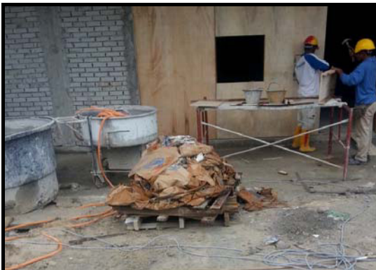
Figure 5: The collection of packaging waste

Common materials found were scaffolding, steel bars, timber pieces and bricks (Figure 6). It was observed that such materials were kept in order and tidy, but no proper storage location was provided. Regarding timber formwork, alterations were made so that they redesigned for another use. Although materials were placed close to the building without blocking the road, the situation appeared to be messy, especially on rainy days. However, 5-10% extra materials were always ordered and stored on site to keep up with the progress of the project.