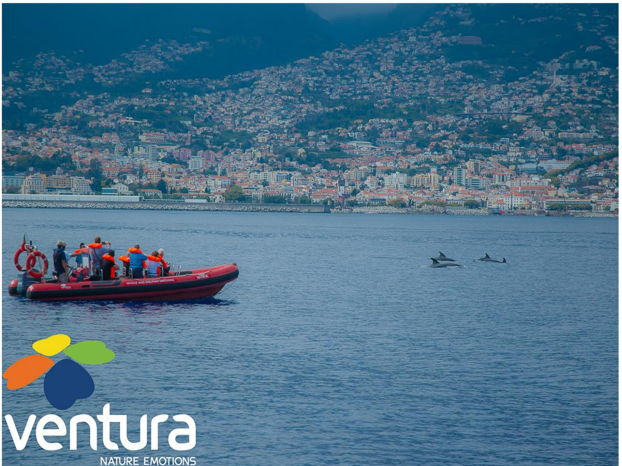
Image: whale-watching in Madeira Island. ('Ventura | Nature emotions', 2014)

Monster of the sea, giant of the depth, Tower capsized in the waves, Appearing everywhere in the rounded sphere; Never created a greater beast: Fin erect at times; Ragingly shattering the seas; Whose awesome and rough members Evoke the hoarse lamentation of Thetis. Whale-we commonly name it. (Brazilian poem, 1769 english version)