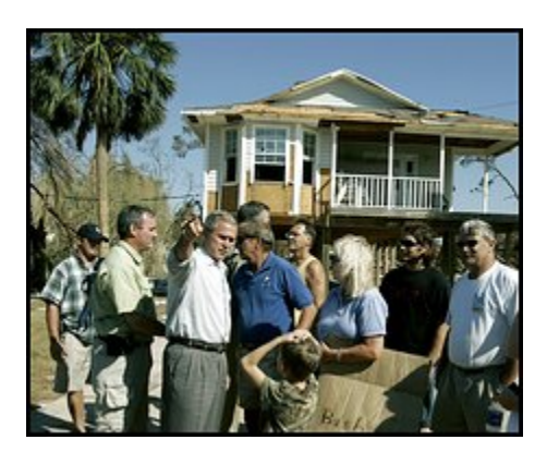
Figure 1. President Bush meets with residents during his tour to assess damage done by Hurricane Ivan in Pensacola.

newspapers, and on television and had the ability to display to voters the support President Bush was giving to Floridians, as well as the support the victims of Hurricane Ivan were giving back to him due to his efforts in their state. These photographs were published both on the White House website, through a photo gallery, and in various news articles, both in print an online, which were released following Hurricane Ivan. The photo galleries, capturing the opportune campaigning moments to demonstrate leadership, displayed his relief efforts so the public had a way to view his efforts, not just reading about them. The photographs were also beneficial to President Bush as he was able to show that he could step away from his campaign trail and appearances and focus on response efforts for the victims of Hurricane Ivan. One of these photographs was included in The Washington Post article (see figure 1).