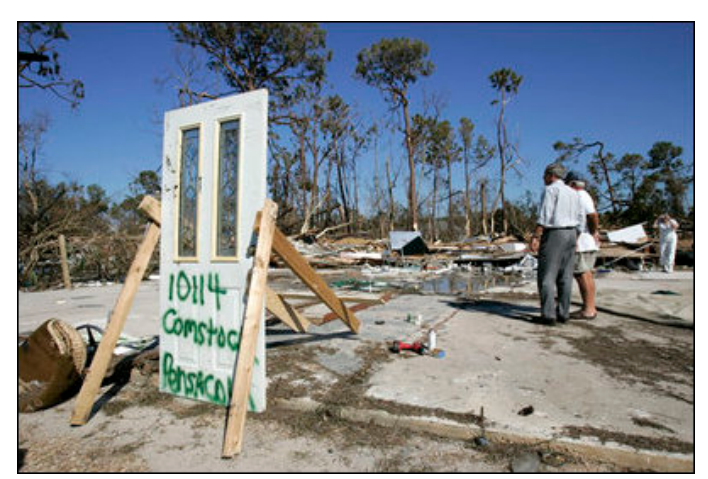
Figure 2. President Bush visits Pensacola, Fla. where residents took him on a walking tour through homes that no longer existed.

Other photographs of his visits to Florida were compiled in a "Hurricane Relief 2004 Photo Essay" by The White House website on their "Hurricane Recovery" page. These images show President Bush surveying damage caused by the hurricanes (see figure 2), consoling residents who were affected by the hurricanes (see figure 3), and working with the First Lady helping the relief efforts by passing out water and other supplies (see figure 4).