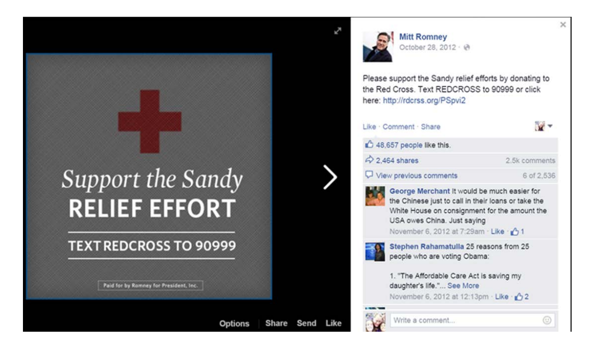
Figure 8. "Please support the Sandy relief efforts by donating to the Red Cross. Text REDCROSS to 90999 or click here: <a href="http://rdcrss.org/PSpvi2">http://rdcrss.org/PSpvi2</a>"

personally involved in the relief efforts. As he did not show himself through this post, in the picture or through a personal statement, both of which President Obama included in his Facebook post, Romney failed to personalize his post enough in the aftermath of Hurricane Sandy.