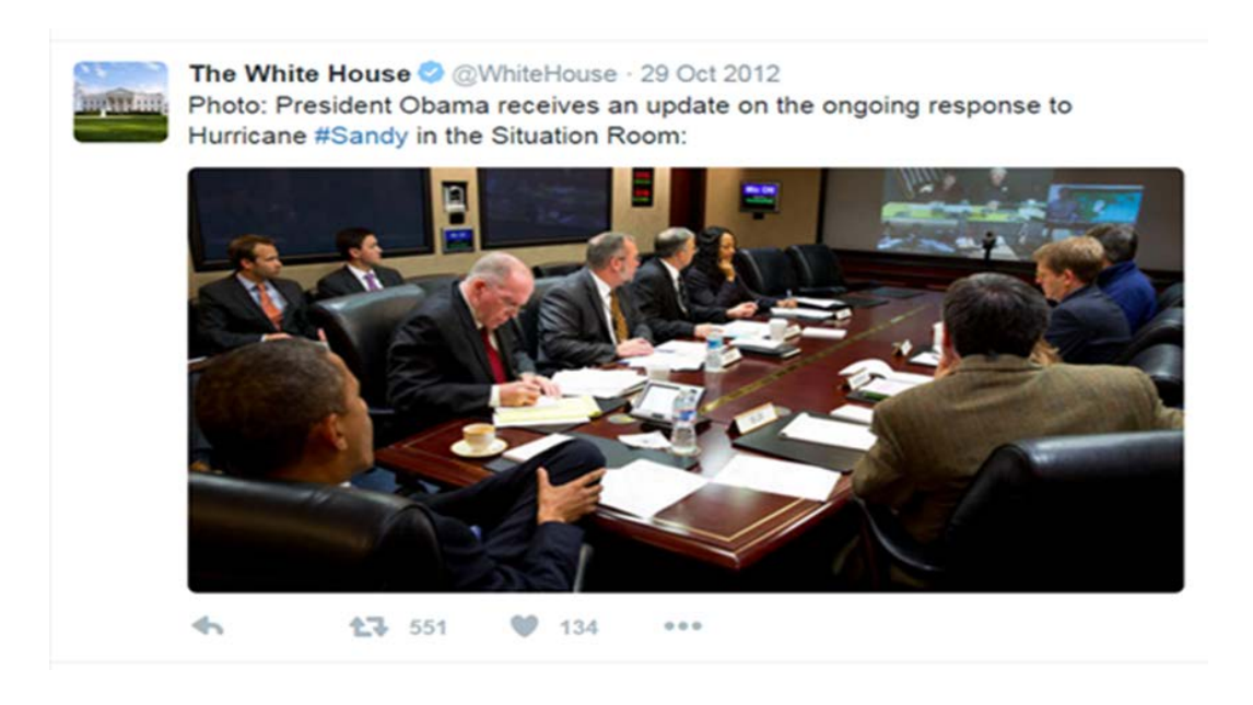
Figure 18. "Photo: President Obama receives an update on the ongoing response to Hurricane #Sandy in the Situation Room:"

The White House provided voters with another view on what response efforts President Obama was involved in during the time of Hurricane Sandy.