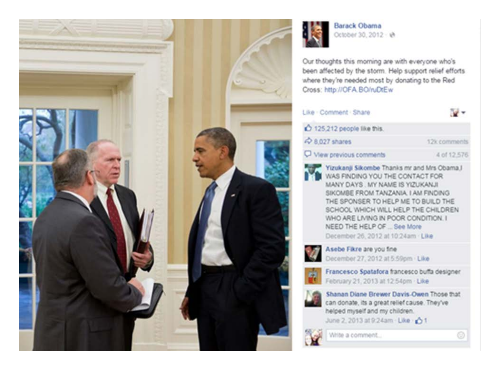
Figure 14. "Our thoughts this morning are with everyone who's been affected by the storm. Help support relief efforts where they're needed most by donating to the Red Cross: <a href="http://OFA.BO/ruDtEw">http://OFA.BO/ruDtEw</a>"