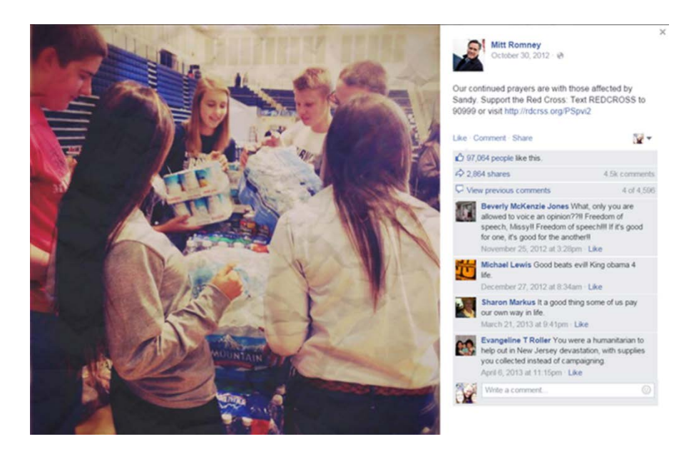
Figure 16. "Our continued prayers are with those affected by Sandy. Support the Red Cross: Text REDCROSS to 90999 or visit http://rdcrss.org/PSpvi2"