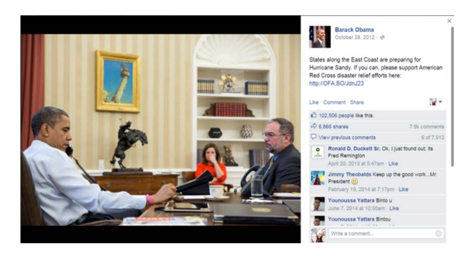
Figure 5. "States along the East Coast are preparing for Hurricane Sandy. If you can, please support American Red Cross disaster relief efforts here: <a href="http://OFS.BO/JdnJ23">http://OFS.BO/JdnJ23</a>"