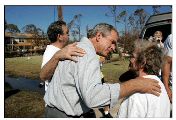
Figure 3. President Bush spends time with local residents during a walking tour of hurricane damage in Pensacola, Fla., Sept. 19, 2004.

damaged by the hurricane. This personal involvement shows his compassion and dedication to the residents who were affected by Hurricane Ivan.