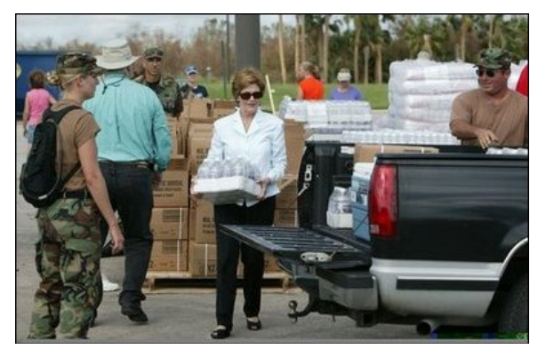
Figure 4. Laura Bush works with volunteers and The Army National Guard at the Indian River County Distribution Center passing out water, ice and Meals Ready To Eat.

This image shows that not only the incumbent is involved in relief efforts for Hurricane Ivan victims, but that his wife, the first lady, is as well. This image shows the First Lady, Laura Bush, working in relief efforts and shows that the First Family is involved personally in relief efforts for the hurricane victims. Therefore, this image shows that not only does the country keep a leader who is dedicated to responding in times of need, but they support a whole family who is dedicated to response efforts if they choose to re-elect President Bush.