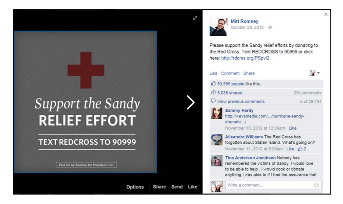
Figure 13. "Please support the Sandy relief efforts by donating to the Red Cross. Text REDCROSS to 90999 or click here: http://rdcrss.org/PSpvi2"

could generate. Therefore, Romney missed the opportunity to use his personal voice, both through the picture on the post and the text message of the post, both of which are too generic to be seen as his own personal voice.