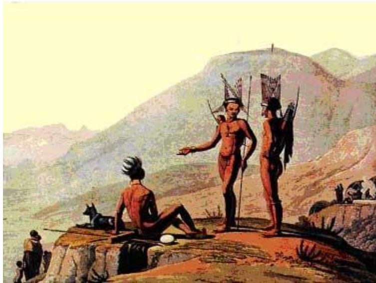
Illustration 1: Artist's Rendition of Khoi People