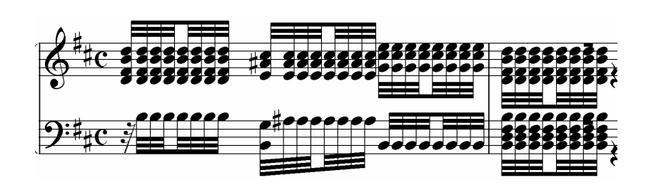
Figure 20: Prelude, Chorale, and Fugue, measures 1 and 2

Clusters and rhythms on clusters using all notes in a measure are another approach to outlining. In the above example, playing two clusters per bar can reveal beautiful harmonic colors not heard when played as written. Playing only the notes that fit comfortably under each hand reinforces the larger note groupings present and aids physical memory. Instead of individual note memory, groupings of notes are felt as a single unit of sound. Clusters in rhythm encourage the pianist to release of the notes instantly. The speed of the rhythm played encourages playing only as deep into the key as necessary to produce the sound. The rhythm is solidified and internalized by using single notes or chords. After playing a short passage in rhythmic clusters, the passage should be played as written. Many passages benefit from rhythmic clustering. Technically difficult passages, such as the opening of the Prelude, Chorale, and Fugue, by Franck are greatly improved.