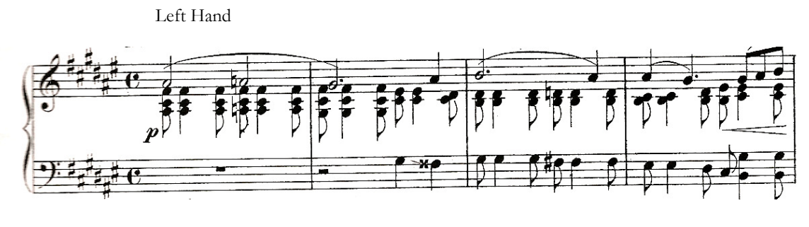
Figure 23: Prelude No. 13, Op. 64 by Cui. measures 1-3.

Rosoff discovered the concept of practicing upside down, with the right hand playing the bass clef and the left hand the treble clef, while she was working with dyslexic students. In an attempt to help them read with less difficulty, she cut and pasted the treble and bass clefs in reverse order. The students became much more fluent. The upside down approach worked. The example below shows the left hand playing the top clef, and the right playing the tones of the bass clef.