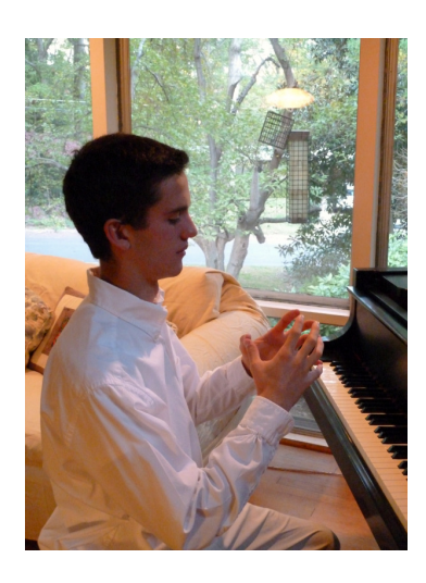
Figure 8: Hands, palms and fingers are focused as the student brings the hands together as closely as possible without allowing the fingertips to each hand to touch. This helps students feel the energy of a natural curvature without placing the hands on the keyboard in a stationary position.