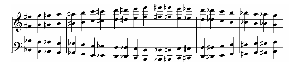
Figure 10: Chromatic Octaves in contrary motion.

Rosoff advocates using the Socratic Method. Students are encouraged to discover what they feel physically as they play the octaves without verbal instruction. Self-discovery is essential for the student to feel the physical motions that promote freedom in playing. Once the octave scale is played, octaves using leaps are practiced beginning with the minor second interval. As leaps using larger intervals are played, the body naturally moves forward to stay closer to the leaps and to feel the security of a snug body. Rosoff developed Whiteside's octave work by adding the chromatic mirror octaves. These are played with the right hand beginning on F-sharp, and the left hand beginning on B-flat. First, a two-octave contrary-motion scale is played. This is followed by chromatic leaps beginning with the minor second, and progressing to full octaves in contrary motion.