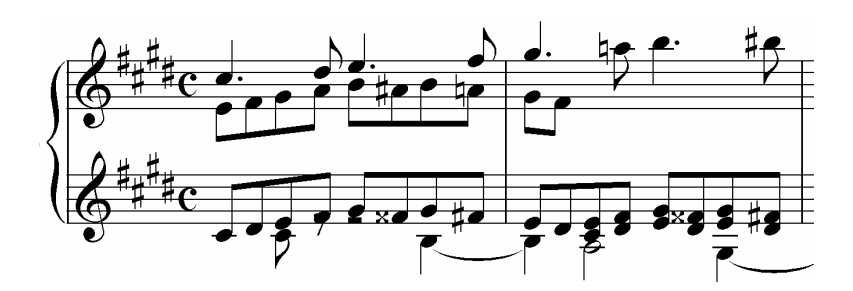
Figure 19: Theme and Variations, Op. 73, No. VII, measures 1-2, by Fauré

The Theme and Variations, Op. 73, No. VIII, by Fauré, provides an excellent example that offers several outlining options. Measures 1 and 2 below may be played in clusters. All notes within easy reach of the hand are played together. This allows the pianist to hear rich harmonic blends that might otherwise be lost to the ear. The open hand is poised to play patterns of sound, rather than one note at a time. It is the whole hand that plays the pattern of sound.