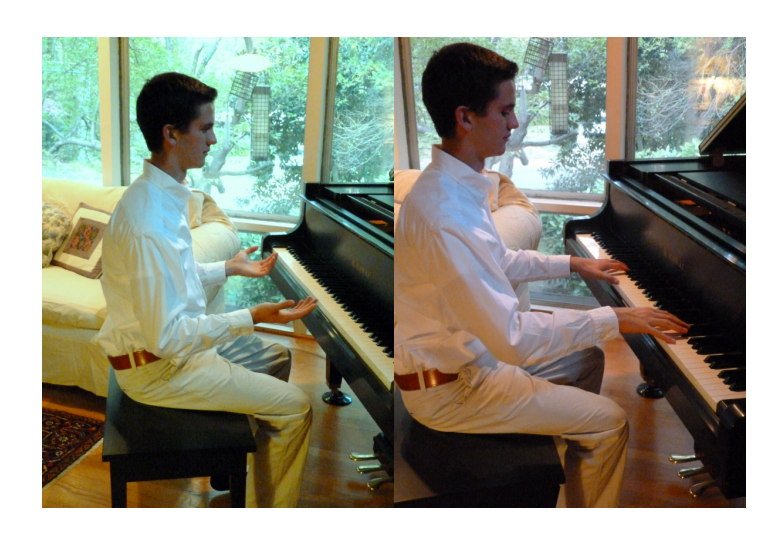
Figure 7b: Arms turn over to a relaxed playing position.