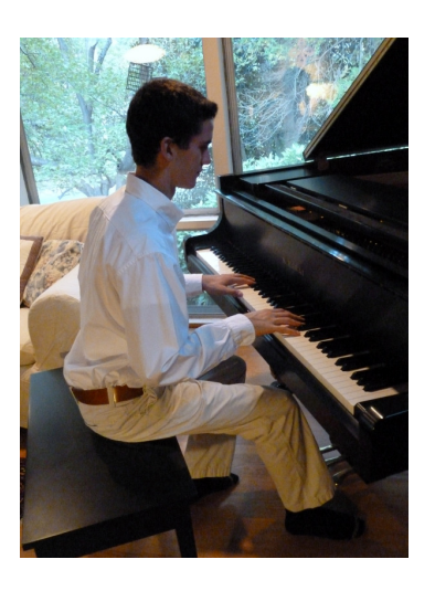
Figure 9: Proper distance from the keyboard and floor with arms hanging loosely by the pianist's side and the hands placed comfortably on the keyboard.

The pianist needs to sit with the arms hanging free on the side of the body so that freedom of movement of the hands and arms is easier to maintain. The proper bench height varies for each pianist. The bench position is optimal when the legs are comfortable and the arms hang freely from the shoulder. Care must be taken to avoid holding the forearms up in the air, or raising the shoulders in an effort to support the weight of the arms. Imagine the elbows pointing straight down. Taller pianists must create a delicate balance between upper body freedom and a comfortable position for long legs. Proper positioning at the piano allows the