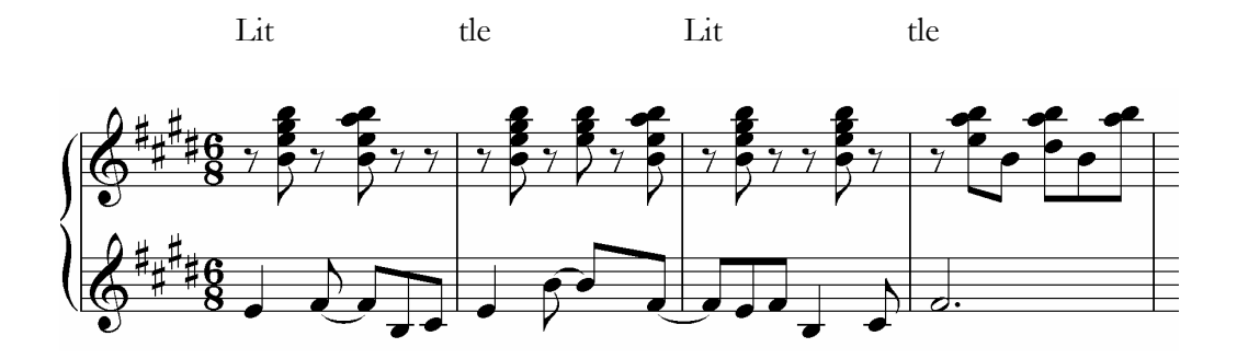
Figure 15b: Syllables used over one measure, using one word per measure.

Figure 15a: Debussy Danse , measures 1-4: Syllables for the word "little" used over two measures, using one syllable per measure.