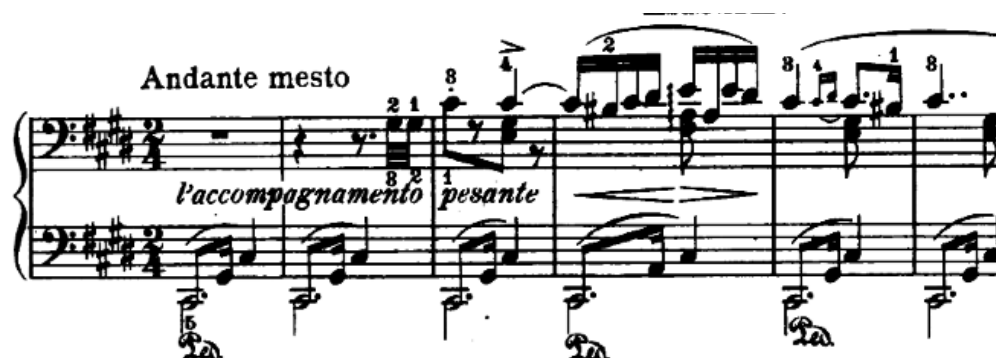
Example 2. Liszt's Hungarian Rhapsody no. 2, measures 1-6.

Two other components were elemental to the verbunkos style: the “Gypsy scale” and characteristic rhythms. The “Gypsy scale,” consists of the upper half of two harmonic minor scales superimposed [C, D, E \flat , F \sharp ] [G, A \flat , B, C]. Running fast notes (eighths or sixteenths) throughout the friska section were one sign of verbunkos rhythm. Another consisted of persistent dotted rhythms ( long, short ). Bartók specifically condemned this rhythm as “in absolute contradiction to the spirit of Hungarian music” 17 and denoted it as the “anti-Hungarian pattern” 18 (see example 3—the dotted rhythm is represented in the top note of the treble clef).