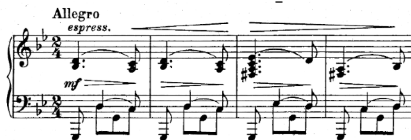
Example 3. Brahms's Hungarian Dance in G-Minor WoO 1, no. 1. Measures 1-4.

Two other components were elemental to the verbunkos style: the “Gypsy scale” and characteristic rhythms. The “Gypsy scale,” consists of the upper half of two harmonic minor scales superimposed [C, D, E \flat , F \sharp ] [G, A \flat , B, C]. Running fast notes (eighths or sixteenths) throughout the friska section were one sign of verbunkos rhythm. Another consisted of persistent dotted rhythms ( long, short ). Bartók specifically condemned this rhythm as “in absolute contradiction to the spirit of Hungarian music” 17 and denoted it as the “anti-Hungarian pattern” 18 (see example 3—the dotted rhythm is represented in the top note of the treble clef).