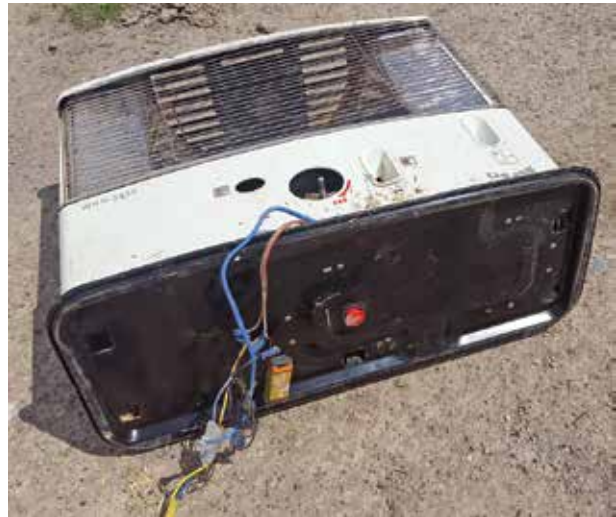
This kerosene heater was modified into an IED that incorporates both a crush necklace and a built-in, anti-lift feature. These devices and others like them are sitting among the rubble inside abandoned homes awaiting returning families.

The successes of the Anti-Personnel Mine Ban Convention (APMBC) and munition stockpile reduction projects have limited the availability of these weapons to nonstate actors. In the beginning of the insurgency campaigns in Afghanistan and Iraq, IEDs tended to use main charges of unexploded projectiles or other factory-produced ordnance. When the stock of munitions ran out, the bomb makers turned to homemade explosive (HME) for main charges. By manufacturing HME from common precursors such as aluminum, urea, ammonium nitrate, and potassium chlorate, the bombers created a nearly inexhaustible supply chain.