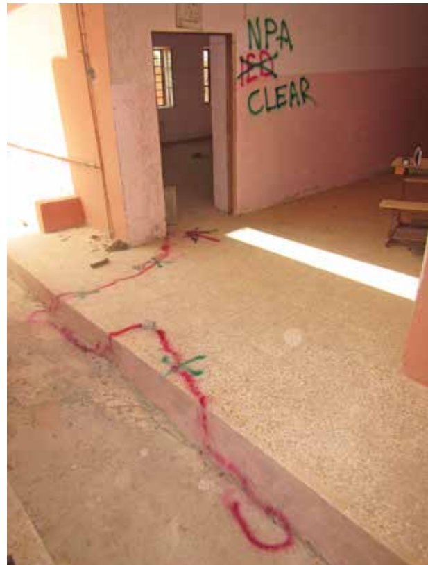
This primary school classroom bears the marking from the HRS clearance process.

Beyond survey and clearance, HMA activities include risk education and community liaison work that have positive indirect effects on clearance. NGOs train local teams who, in turn, teach local people how to recognize, avoid, and report hazards. The obvious benefit is saved lives. But local reporting also provides a massive boost in information collection and task prioritization. Further, NGOs gain community acceptance that can also have security benefits on the ground, particularly in countries that are suspicious of foreign people and organizations.