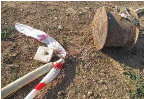
The same PPIED after neutralization. Note the square, white electronic anti-lift device on the left.

repurposed material. Typical net explosive quantity (NEQ) ranges from 6 to 20 kg (13 to 44 lbs), although much larger charges have been found when targeting vehicles. Secondary anti-lift features are common, as are dual pressure plates. If on the surface, even a child's footstep is enough pressure to function the device.