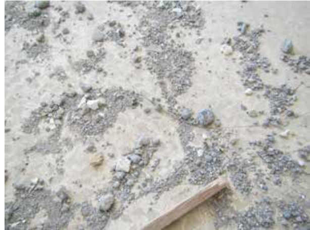
The rubble from an adjacent IED detonation makes the crush necklaces even harder to see.

Yet the charges are powerful enough to destroy a truck and kill the occupants. PPIEDs currently encountered in Iraq are generally robust in design and can remain functional for several years. Other improvised mines, which mimic factory-produced mines in form as well as function, use mechanical cocked-striker fuzing, and these may have even longer operational lifespans than electronically-fired systems. ISIS deploys these improvised mines in long, patterned rows to defend against