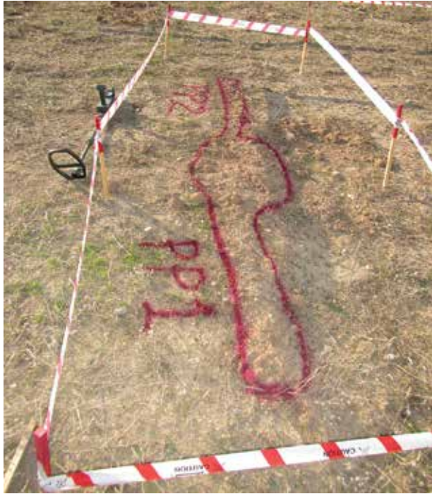
A typical PPIED with dual pressure plates. The national staff searchers have marked it for the IED specialists to prosecute.