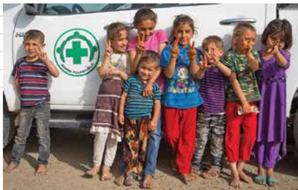
Beneficiaries of NGO clearance. These children can now return to school after more than two years without formal education.

Based on the authors' experience in the commercial and HMA sectors, NGOs are far more cost-effective than for-profit companies. Because NGOs operate at lower costs, and because they actively work to build self-sustaining national capacity, the value per dollar and sustainability are much better. However, highly-capitalized commercial companies are more agile in initial deployment and redeployment than NGOs.