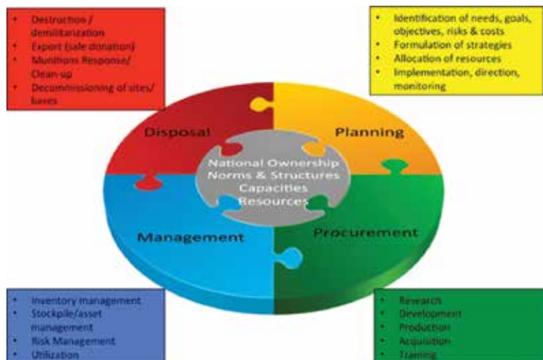
Figure 6. The Survey's LCMA Model.

aspects required for the effective incorporation of the IATG at the national level. Indeed, one of the components of the handbook—a summary of the IATG's more than 40 modules—will be made available as a stand-alone output and featured on the United Nation Office for Disarmament Affairs (UNODA) website. As anticipated, the full study will be published in both English and French. As a first step, the Survey will work with MSAG, UNODA, and other partners, to make the IATG summary available in the four other official U.N. languages (Arabic, Chinese, Russian, and Spanish). The centerpiece of the Handbook consists of an LCMA Model that comprises four main elements: planning, procurement, management, and disposal (see Figure 6). The Handbook takes advantage of a case study on the experience of establishing an LCMA system in post-conflict Bosnia and Herzegovina, and will incorporate examples of challenges and good practice from across the globe.