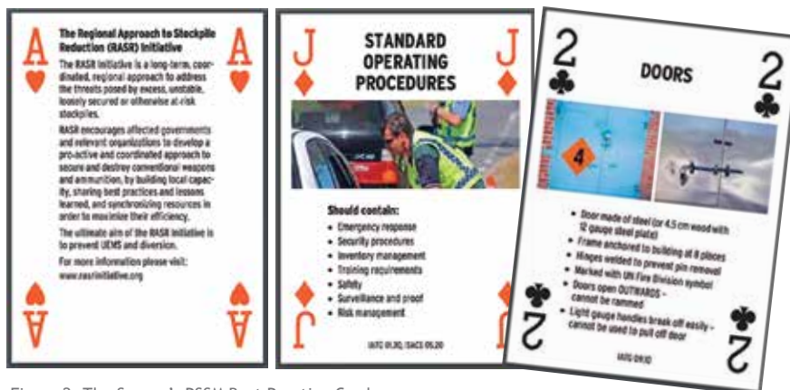
Figure 2. The Survey's PSSM Best Practice Cards.

The Survey continuously updates the UEMS Database and developed the UEMS IRT to assist in this process. 5 The Survey knows that this tool is in considerable demand from the more than 10,000 times it has been downloaded from the Survey's website. 6