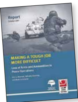
Figure 7. A Survey publication supporting the MPOME Project.

(see Figure 7). 11 The report shows that the scale and scope of losses of contingent-owned equipment (COE) in peace operations is greater than appreciated, and that improved practices could reduce the amount of materiel lost, and enhance a mission's force protection posture and its ability to implement its mandate. The MPOME Project, which commenced in December 2016, builds on this work; it has four components. One concerns a series of regional workshops that will allow practitioners in peace operations to share their experiences and, in so doing, chip away at the perceived taboo that such matters are too sensitive to discuss. A second element involves working with actors undertaking peace operations to develop countermeasures to better manage COE as well as recovered materiel in peace operations. For example, the Survey will work with the African Union to develop guidelines or standard operating