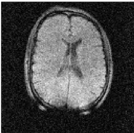
Figure 2: Image from a volunteer's head, obtained at an evolution field of 100 mT.