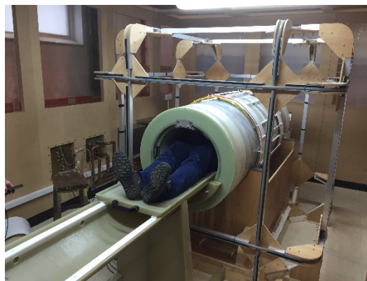
Figure 1: The FFC-MRI system and earth's field cancellation coils.