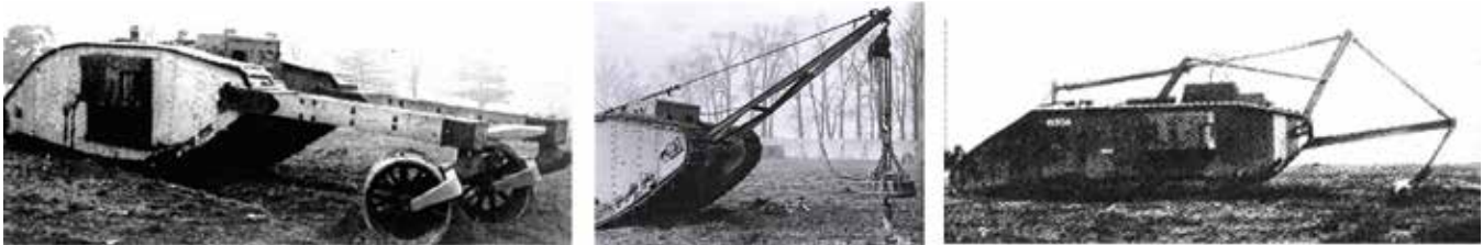
WWI demining machines.