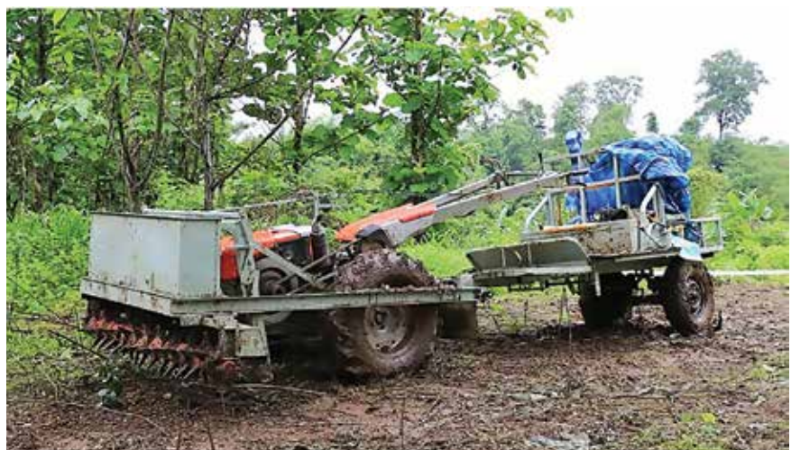
The Groundhog area preparation machine made for a particular task in Burma.

For example, in 2014, it was impossible to get the Burmese government's permission to import any demining equipment at all. For a particular task involving small gelignite pressure mines, a small area preparation machine was made that removed the undergrowth and detonated some devices in advance of manual