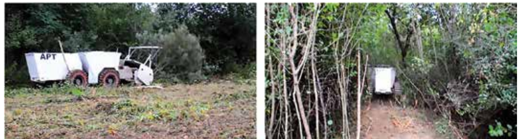
Stills from a video of APT during field trials.