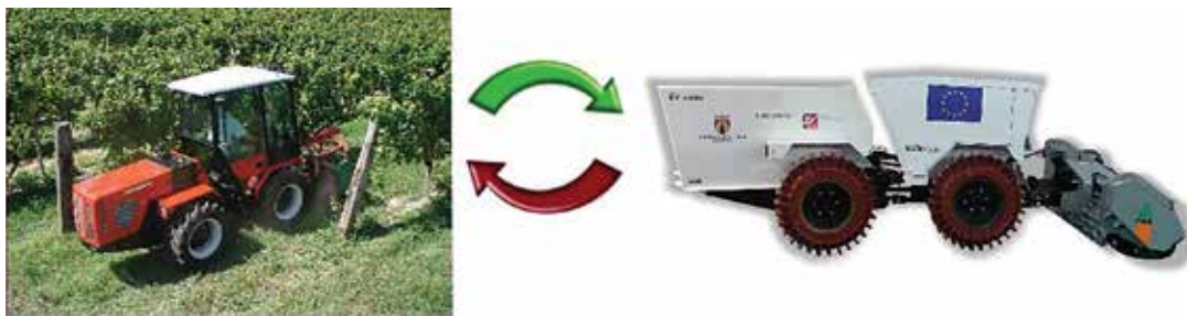
The tractor and the conversion to a demining machine.

demining using the Rake Excavation and Detection System (REDS), a long-handled raking system. 5 This task-specific machine, only suitable for that threat on level ground, did the job well. The two-wheeled rice tractor on which it was based is back working in Burma's rice paddies now.