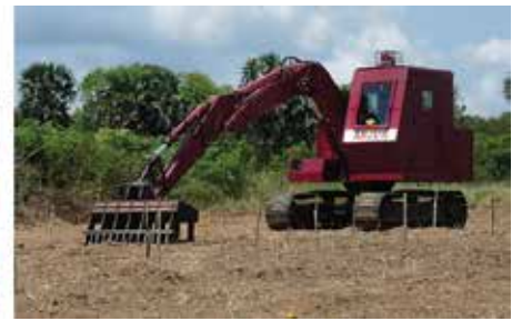
A backhoe in Afghanistan, an articulated hydraulic mulcher arm on the back of a Werewolf mine protected vehicle (MPV) in Angola, and an Arjun raking excavator in Sri Lanka.

tool, not under their tracks or wheels. The tool will be damaged but is designed to allow fast repair. Some can withstand multiple detonations before the cumulative shock-wave damage necessitates an extensive overhaul. Thus, all the large demining machines are only more-or-less AT mine resistant. Their size and weight make the machines difficult to deploy, and their running costs, including fuel and repairs, are very high. Just importing them to the country of use can add significant costs and involve lengthy delays. Often oversold as clearance machines, many large machines are abandoned when the cost of repair and maintenance is too great to justify their continued use.