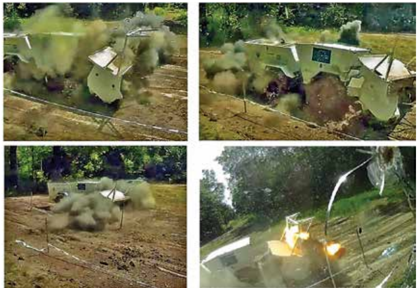
Stills from a video of the testing using real mines. 14

The C-IED platform can simply replace the mulcher on a demining APT or can be fitted to a dedicated C-IED APT with upgraded (rifle resistant) armor and refined decontamination features. 15