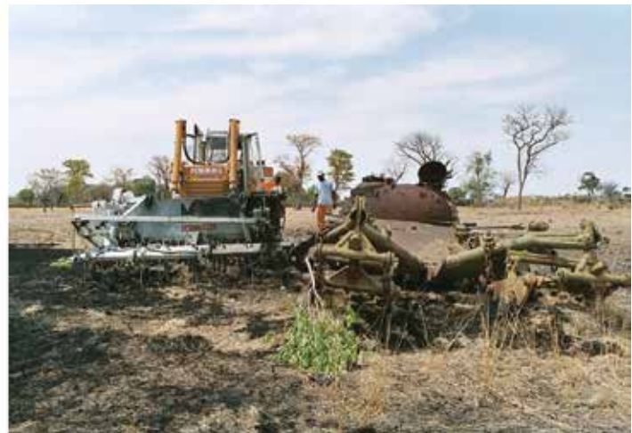
Left, a blast damaged Aardvark flail in Libya and right, blast damaged demining machines in Angola.