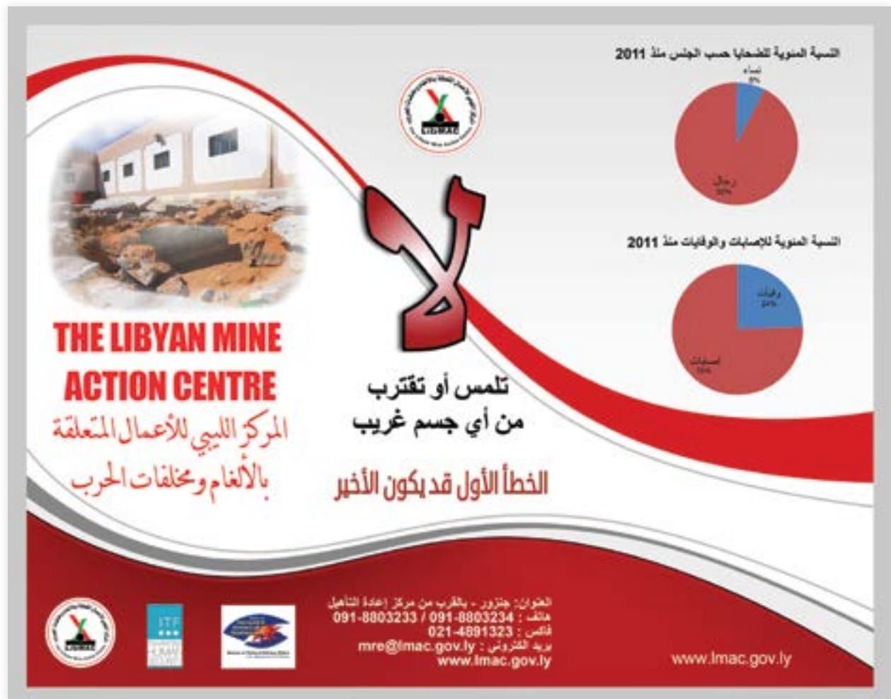
Risk education materials recently developed for use in August 2016 in Abu Grain, Benghazi, and Sirte, Libya.