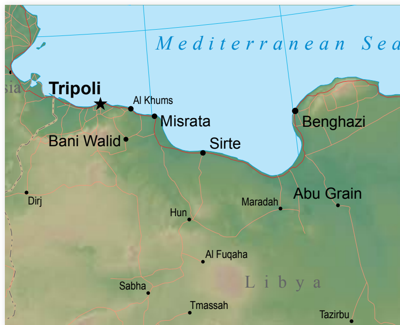
Figure 1. Map of Libya.