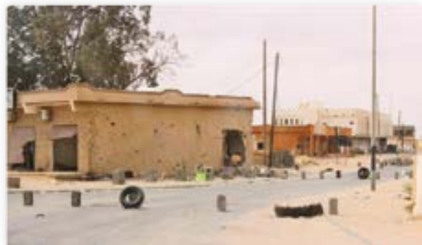
Area of Abu Grain in close proximity to the strategic intersection, May 2016.

from landmines, improvised explosive devices (IED), and ERW. They were joined by LibMAC's quality-assurance officer, allowing the team to compose dozens of non-technical