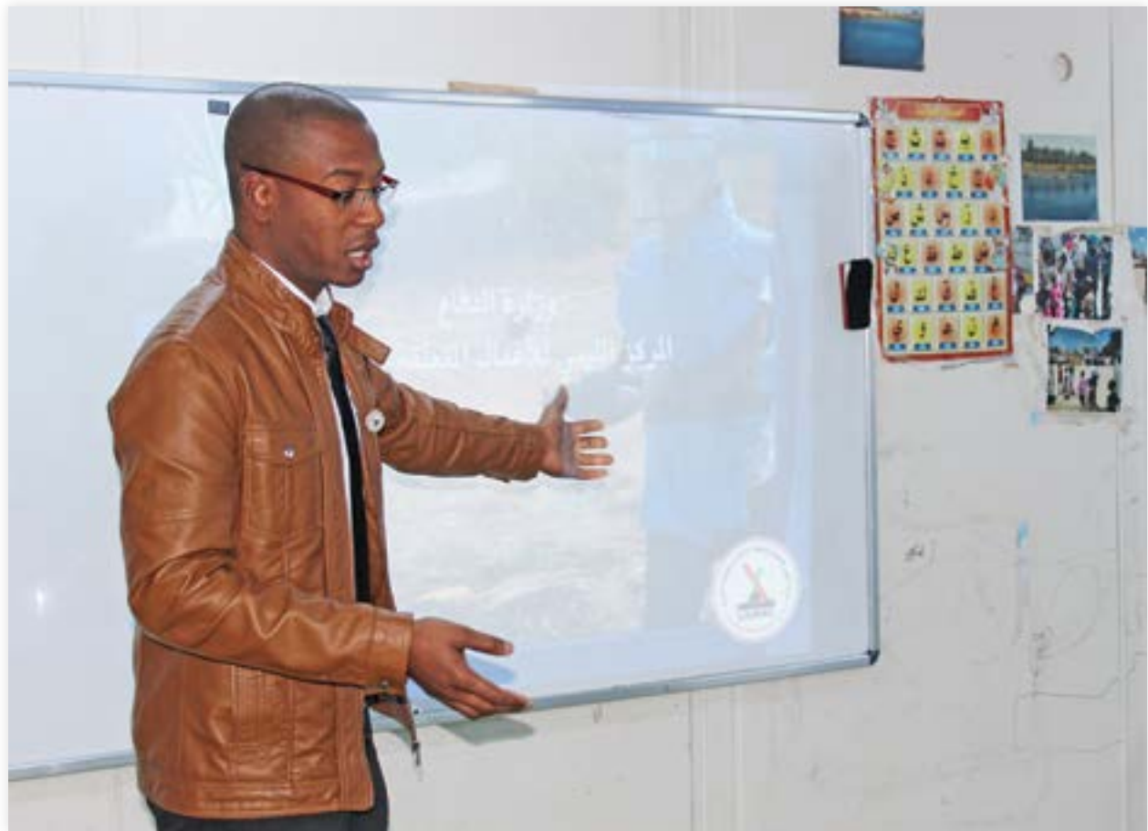
LibMAC RE section chief during training sessions in Tawarga IDP camp in Tripoli, Libya (February 2016).

With very solid groundwork laid by the RE technical adviser, ITF envisions additional, stronger support for RE activities. Conscious of the risks posed by ERW in Libya, prioritizing education will involve providing more comprehensive, long-term, and geographically widespread support for RE activities. Based on the assessment of LibMAC's needs and in consultations with PM/WRA as the donor, ITF proposes to support LibMAC's RE section to minimize the deadly impact