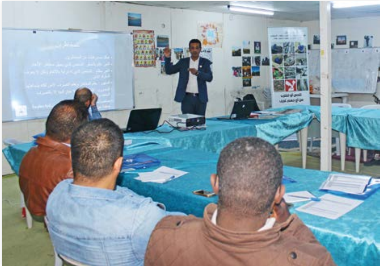
Training delivered by LibMAC RE section staff in Tawarga IDP Camp in Tripoli, Libya (February 2016).

surveys and hazard area information reports by mid-June. Reports were delivered to the Information Management System Mine Action database officer in LibMAC and are being processed further before being utilized as the foundation for future mine action operations.