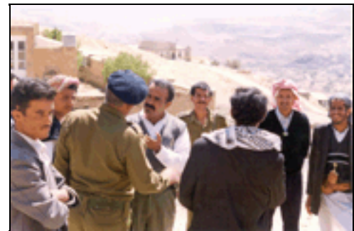
A Field Supervisor is seen coordinating survey activities with local authorities in Ibb governorate, Yemen.

The United Nations Mine Action Service (UNMAS), on behalf of the Yemen NDC, requested the Landmine Impact Survey in Yemen. The Survey Action Center (SAC) implemented the Survey in conjunction with the Afghanistan-based Mine Clearance Planning Agency (MCPA), in accordance with the guidelines and protocols set forth by the Survey Working Group (SWG). Funding for the Survey was provided by the governments of Canada, the United States, Germany and Japan, and included partial matching by the United Nations Foundation. The Survey was made possible through a contracting mechanism and with the support of in-country UN staff provided by the United Nations Office for Project Services. Conducting the Survey in Yemen cost a total of $1,650,000 (U.S.). Of this amount, $450,000 consisted of non-expendable equipment such as vehicles transferred to the NDC as part of a plan to expand national mine action capacity.