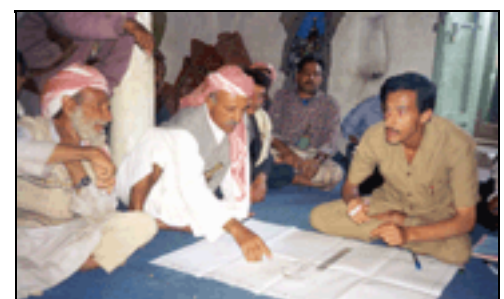
A community interview in Al-Nadera district of Ibb governorate, Yemen.

The results of the Survey clearly indicate that the Republic of Yemen suffers many adverse consequences from landmines and UXO contamination. The collected information will allow for the creation of a well-planned and targeted set of mine action initiatives. Given sustained funding support, these initiatives will allow Yemen to free itself from the most adverse consequences of landmines. Economic opportunity and enhanced