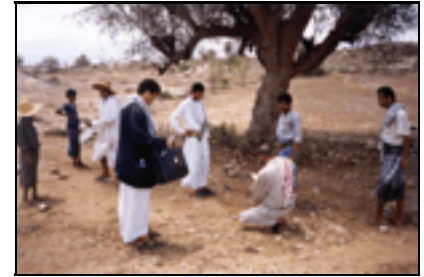
Proximity Verification of a mined area in Hajja governorate, Yemen.

The 592 impacted communities indicated by the Survey are distributed in 18 governorates, primarily in the southern and central portions of Yemen. There are an estimated 828,000 Yemeni civilians, roughly 6 percent of the total population, living in these communities. This means that at least one in every 16 Yemeni lives by, works near or is otherwise affected by the presence of landmines. 1,078 distinct mined areas were located with a total reported surface area of 923 million square meters.