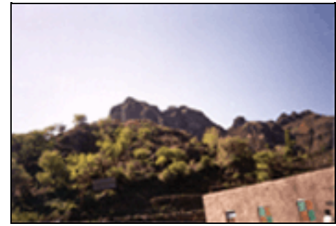
Two adjacent mined areas on the peak of a mountain blocking access to drinking irrigation water in Ibb governorate, Yemen.

There have been extensive efforts since 1998 by the government of Yemen with assistance from the government of the United States to address the landmine problem. However, in order to have an overall picture of the landmine problem in Yemen and obtain the necessary information required for an effective national mine action plan, the government of Yemen, the United Nations and the donor community conducted a Landmine Impact Survey in the Republic of Yemen from July 1999 to July 2000.