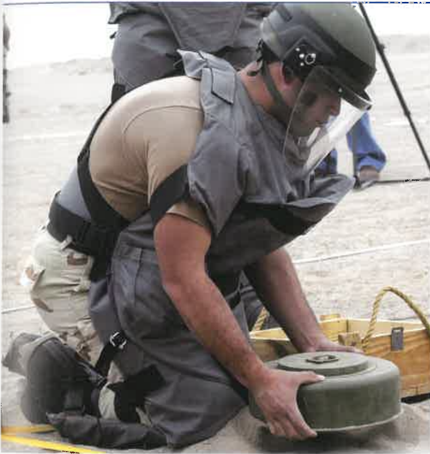
A Chilean soldier removed a landmine near the borders of Peru in Arica, Chile.