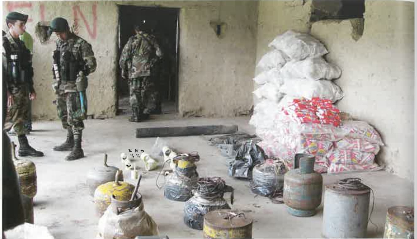
A group of soldiers confiscates a large quantity of explosives allegedly located with the Revolutionary Armed Forces of Colombia, or FARC, in houses near Santa Rosa, some 255 miles southwest of Bogotá, Colombia.

tary component. This is the entity certified by the national mine action authority to carry out demining operations in each country. The work carried out by the military engineers in support of demining activities is very efficient due to the organization, discipline and training that they possess. They contribute to the execution of demining operations and the destruction of stockpiled anti-personnel mines. In order to reduce the number of accidents during these operations, international standards for humanitarian demining are employed. The military also supports national MRE and training activities in cooperation with the supervisors of MARMINCA.