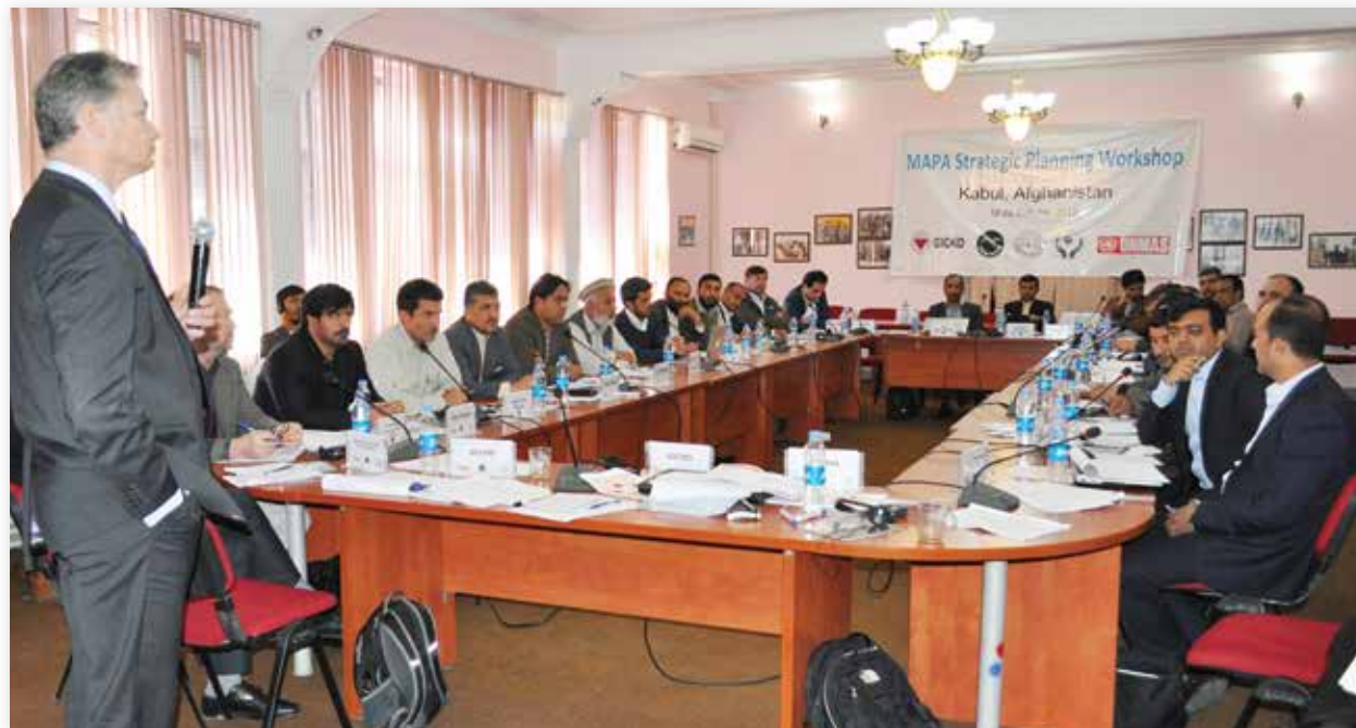
The National Mine Action Strategic Plan (NMA SP) workshop, 18 October 2015.

The Mine Action Programme of Afghanistan (MAPA) has surveyed and cleared almost 80 percent of all known mine/ERW contamination throughout the country. MAPA's main functions are coordinating, planning and setting priorities, information management, mobilizing resources, and ensuring quality of mine action services, advocacy and communication. The Directorate of Mine Action Coordination (DMAC), which works under the Afghanistan National Disaster Management Authority, partners and coordinates with the United Nations Mine Action Centre for Afghanistan (UNMACA) under the United Nations Mine Action Service (UNMAS).