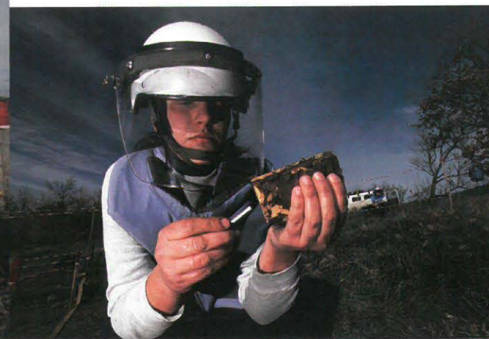
■ A close up of the steps involved in demining.