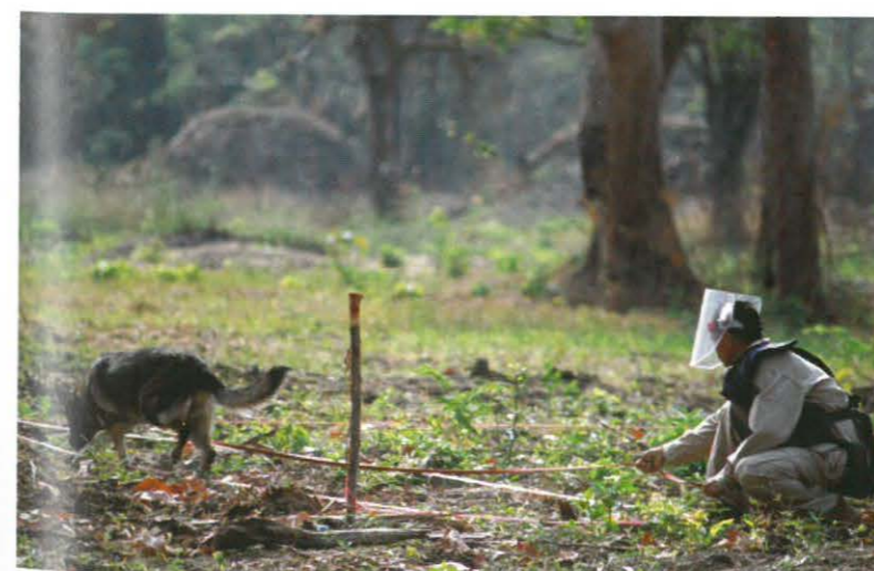
■ TMAC uses a combination of manual demining, mechanical demining and MDD methods in order to tackle Thailand's mine problem.