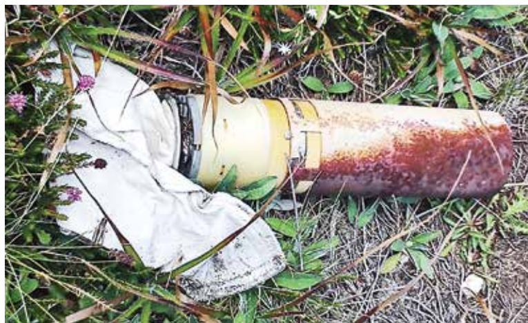
Unexploded BLU-97 A/B submunition at Crni Krs in Oklace community, Zubin Potok municipality.

Based on information received locally, NPA confirmed two NATO strikes in the community. The local population confirmed they feared entering the area surrounding Boljetin village and Sokolica monastery. The police station in Zvečan was also informed by paragliders that they noticed unexploded submunitions from the air. The total hazardous area is 0.06 sq mi (0.15 sq km) or about 30 soccer fields. NPA estimated that at least two RBL-755 cluster bombs were dropped, dispersing