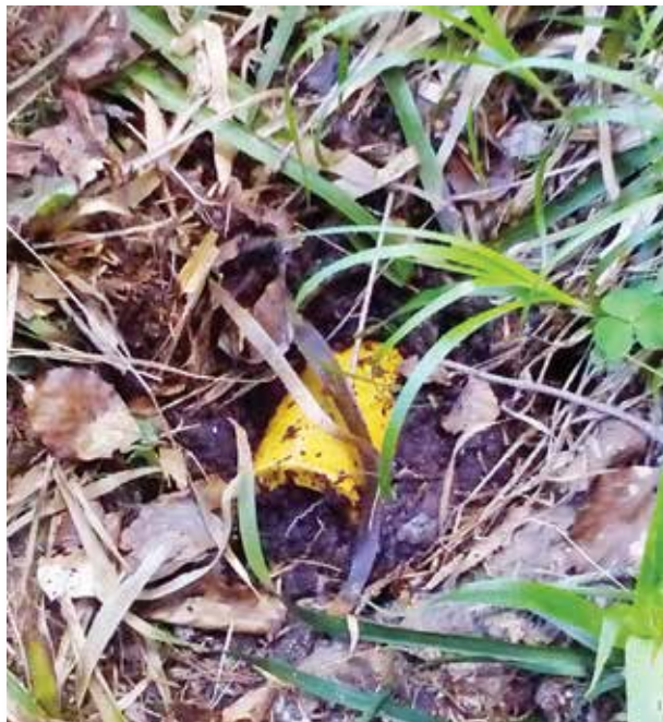
Unexploded BLU-97 submunition at Tovariste in Záža community, Zvečan municipality.

2014 through July 2015, NPA conducted desk study and field-based, non-technical survey (NTS) to assess and confirm CMR contamination. These activities were done in partnership with local authorities and KMAC.