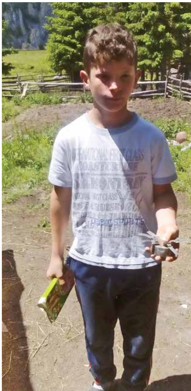
A child finds parts of a BLU-97 submunition in Oklace, Zubin Potok municipality.

MK-4 submunitions. NPA estimated that 30 MK-4 submunitions remained for clearance.