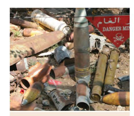
Various types of ordnance that the United Nations has collected in southern Lebanon in its efforts to clear the region of landmines, unexploded missiles and cluster bombs. Unexploded cluster submunitions are reportedly being found in high numbers in southern Lebanon, indicating a high failure rate of some of these munitions when used during the 2006 conflict (see story on page 38).

Before the recent conflict in Lebanon involving Hezbollah, Israel used cluster munitions in its 1978 and 1982 incursions into Lebanon.13 The two-decade-old unexploded submunitions from Israeli campaigns have continued killing and injuring civilians, with over 200 civilian casualties recorded between 2000 and 2005. To be fair, it must be understood these casualties include both