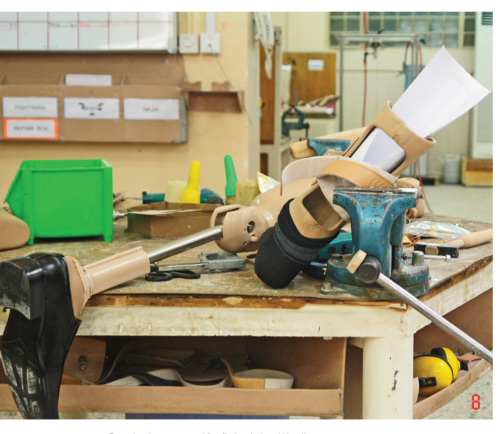
Prosthetics prepared for fitting in Iraqi Kurdistan.

survivors living in central and southern Iraq. Yet, the health care infrastructure still lacks the capacity to comprehensively address the needs of mine/ERW survivors in the Kurdistan region.