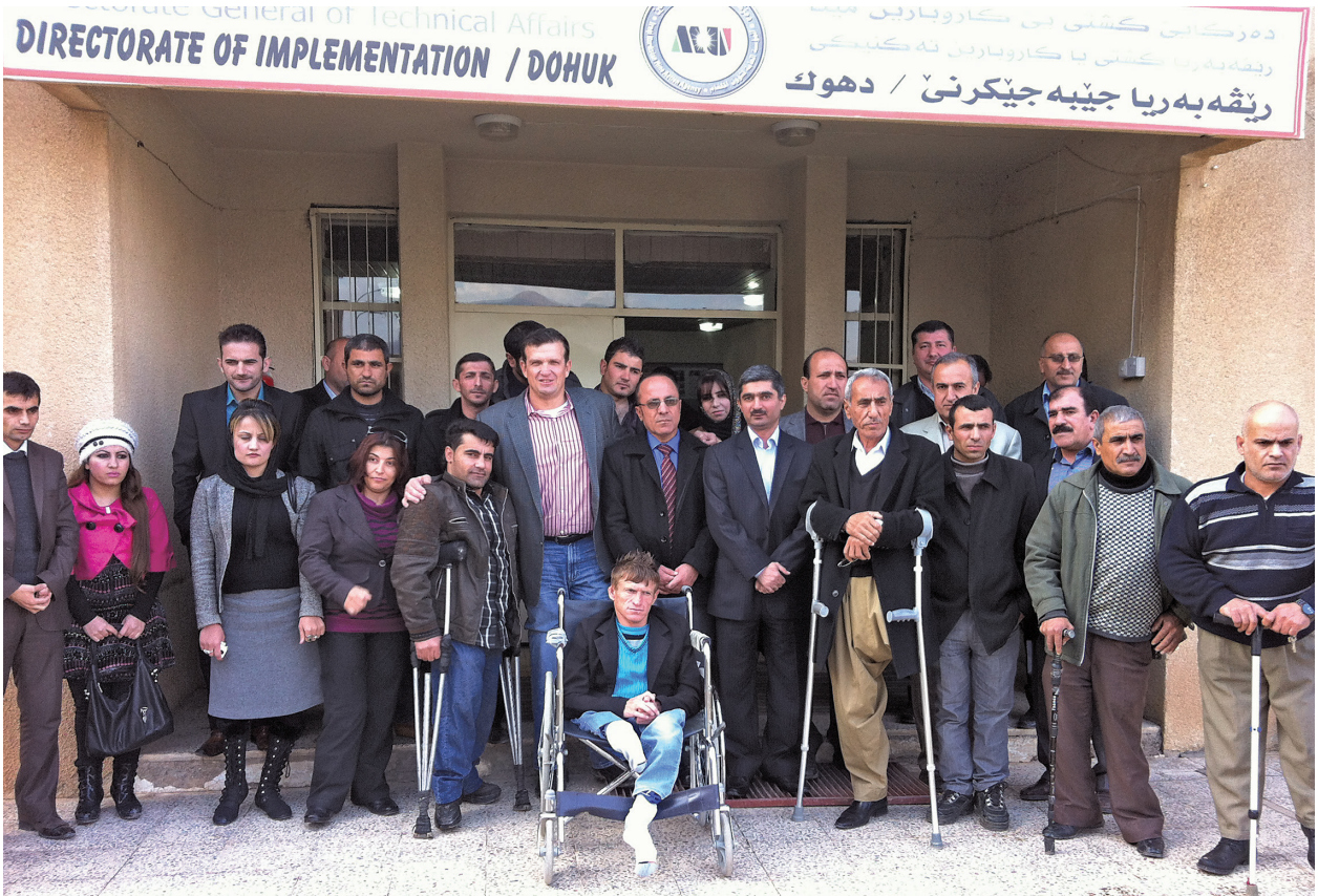
Photos from a peer-support planning trip in Erbil and Dohuk, Iraq (January 2012).