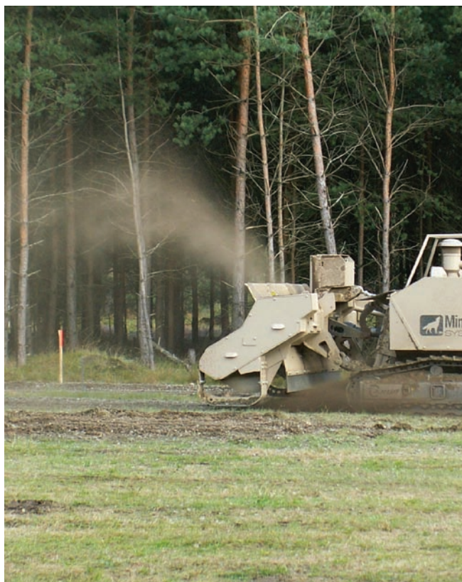
Mini MineWolf during the German Army tests (gravel, 20cm).

The purpose of the trial was to determine the capability of the Mini MineWolf to neutralize AP mines at three different depths in three different types of soil: gravel, sand and topsoil, based on a statistically meaningful sample—in this case 900 WORM mines in 18 different test conditions. The results of the trial showed that the Mini MineWolf was successful against the simulated AP mines with both flail and tiller attachments. The actual results with both attachments are listed in the tables below.