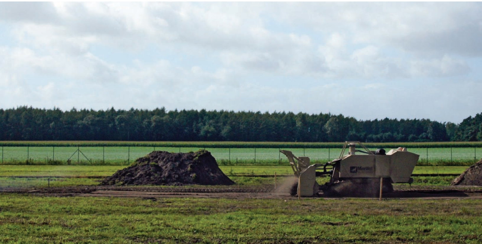
A detonation sequence of the Mini MineWolf activating an anti-tank mine during the German Army tests (above and opposite).

To simulate AP mines, wirelessly operated reproduction mines were used. Designed by CCMAT, WORM mines simulate the physical properties of typical AP mines, and are equipped with sensors and radio-frequency transmitters to detect and report damage inflicted by