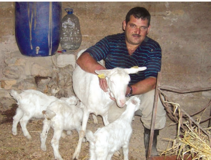
A war victim cares for his goat and her newborns.

Background. Just as several other administrative districts of southern Lebanon have suffered from occupation and military conflicts for 22 years, the district of Jizzine was left facing dire socioeconomic problems. The most severely affected in the district were war victims (mainly survivors of landmines), their dependents, and the surviving dependents of individuals killed by landmines or war accidents.