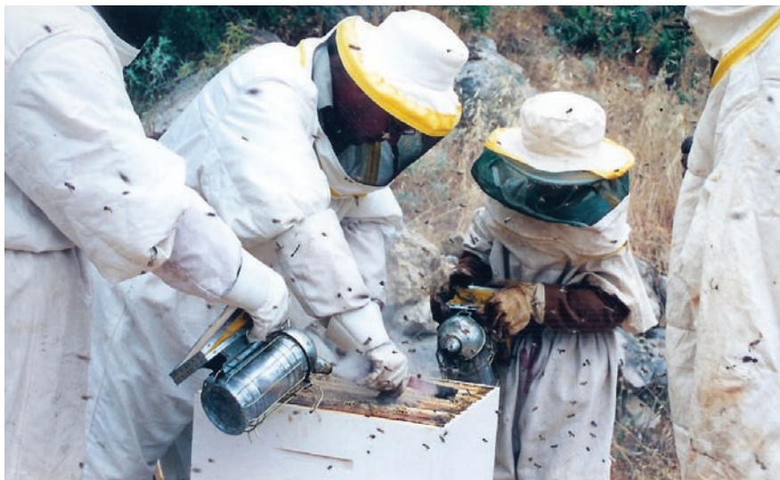
A landmine survivor (center) checks his beehives with the help of his son as beekeeping experts watch.

WRF has also been investing efforts and resources in management and marketing activities essential to project efficiency, efficacy and viability, and to sustainability of impact. Particular emphasis has been placed on the marketing component of the project, which addresses the marketing and sales of all products of the Co-op members (project beneficiaries) and ensures financial returns to individual beneficiaries as well as to the Co-op. Significant to note here is that Co-op product availability is not limited to the district of Jizzine; rather, Co-op products are available in all major outlets in Beirut, Mount Lebanon and South Lebanon.