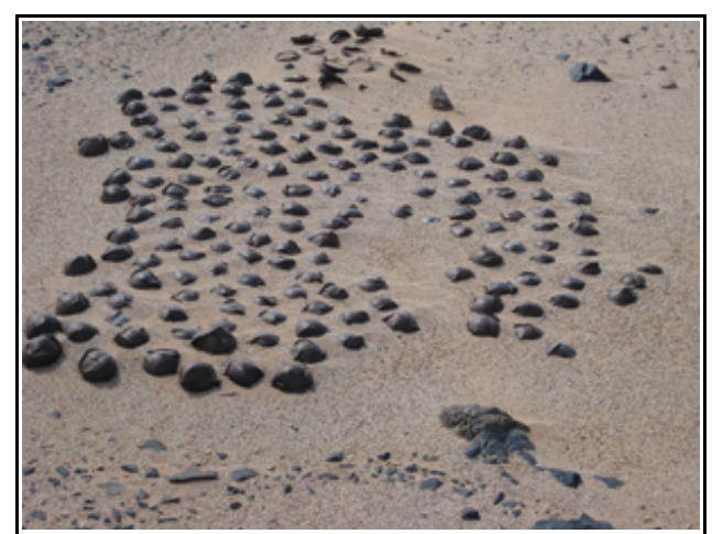
A BLU 63 strike area.

minefields, 186 cluster-munition-strike areas and one ammunition dump. All the hazardous areas and individual dangerous items identified were marked and mapped in the Information Management System for Mine Action and prioritized into high-, medium- and low-priority tasks based on specific criteria including proximity to main population centers, water points and routes, and the potential threat posed to the local population. No Dangerous Area Survey has been conducted in the buffer strip<sup>3</sup> vet.