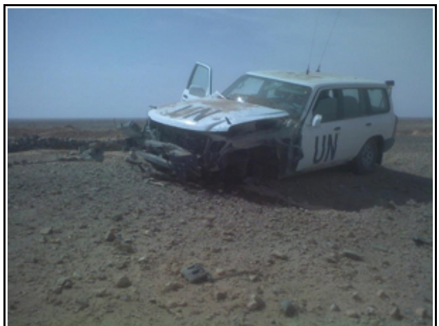
A U.N. military patrol accident in Oum Dreyga, August 2009.