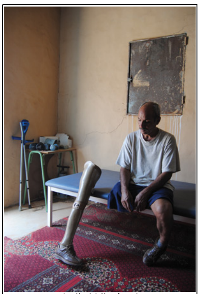
A mine victim in the Chedid Cherif Landmine Victims Centre in Rabouni, Algeria.

Frente POLISARIO authorities grant free medical support to mine/ERW victims in the Tindouf, Algeria, refugee camps. The hospital in Rabouni, Algeria, which also provides psychological assistance to the victims, tends to victims who cannot be treated in the camps. Saharan refugee camps host schools for children with disabilities run by the Frente POLISARIO. The Landmine Action Rapid Response Team operates and responds 24-hours a day, seven days a week east of the berm to emergency mine/ERW incidents.