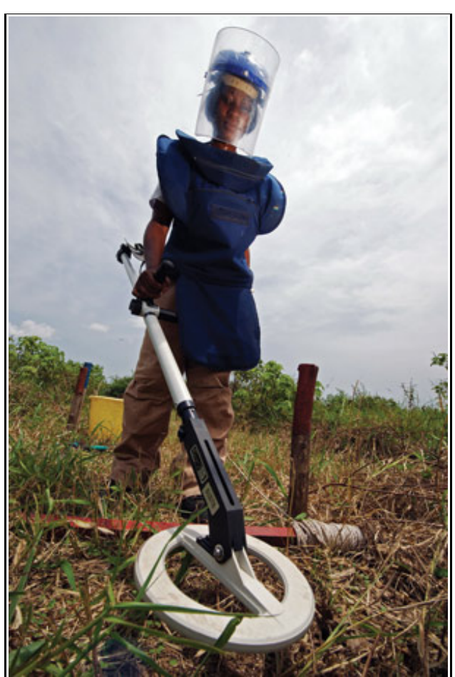
A female deminer in the Democratic Republic of the Congo.

to Ban Landmines to reevaluate the review and