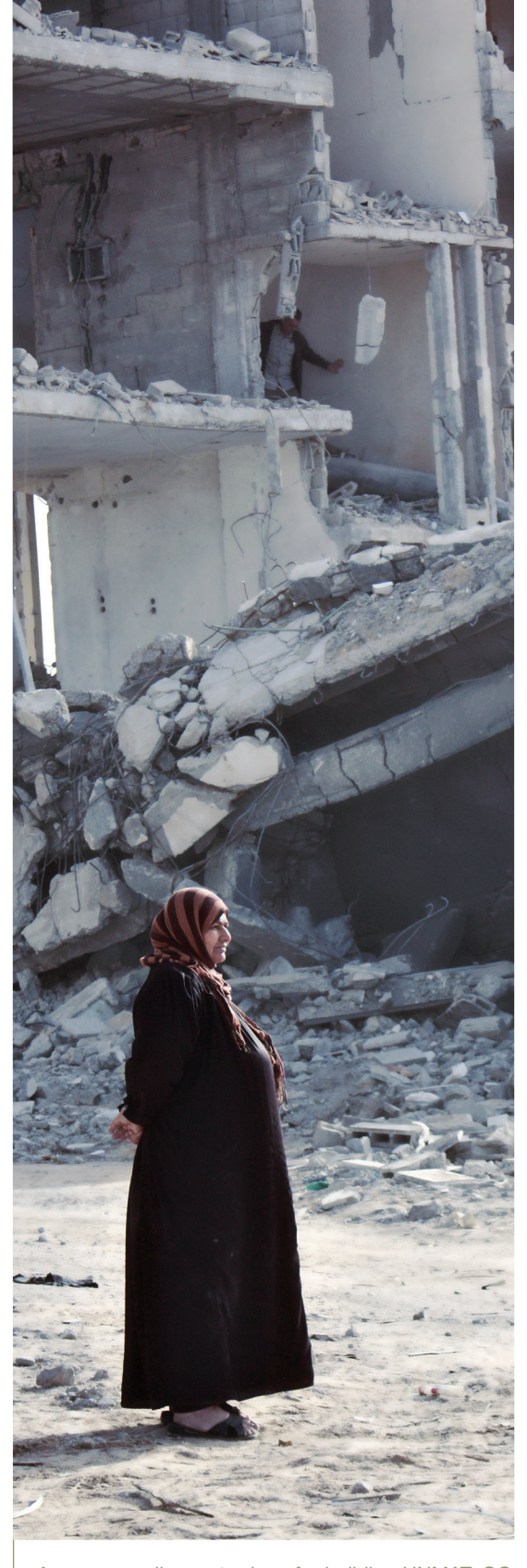
A woman walks past ruins of a building UNMAT-GO will investigate for evidence of UXO.

contained white phosphorus and 72 percent contained high explosives. As of 30 June 2009, unconfirmed reports indicated there had been nine post-war accidents resulting in eight fatalities and 27 injuries.