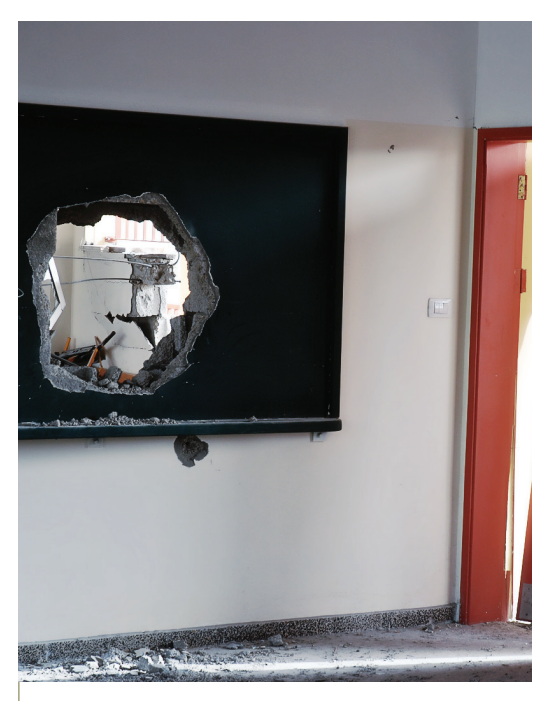
Damage to a classroom in a Balgis al Yemen school, one of the many buildings investigated by the Technical Assessment team.