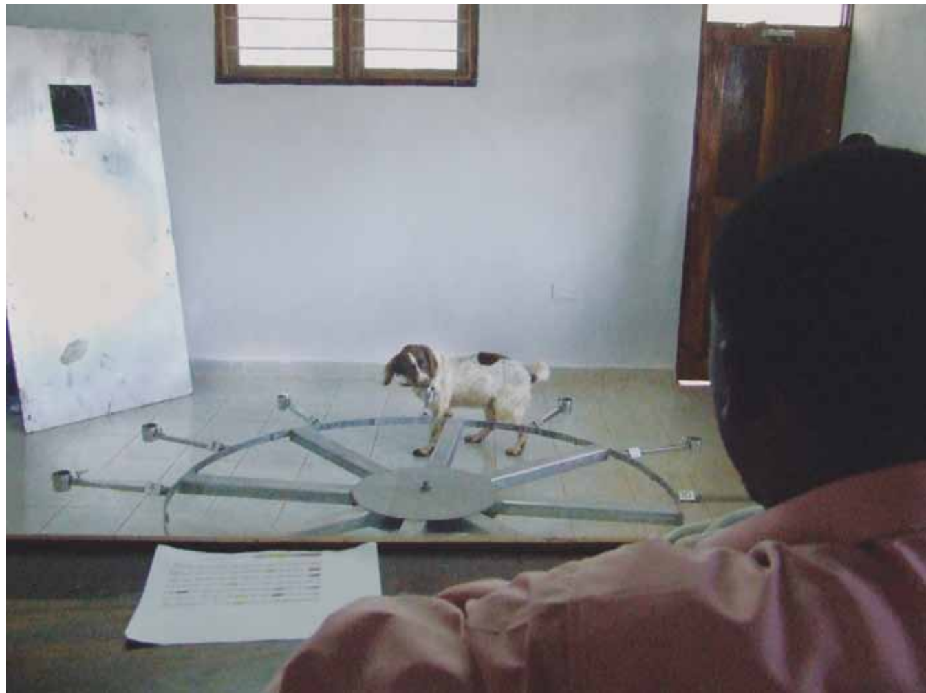
A dog sniffs a container with soil samples, some of which contain a small amount of TNT (positive sample) and others that are TNT-free (negative sample). The dog moves around the carousel, sniffing samples at the end of the arms and identifying positive samples by sitting beside them.