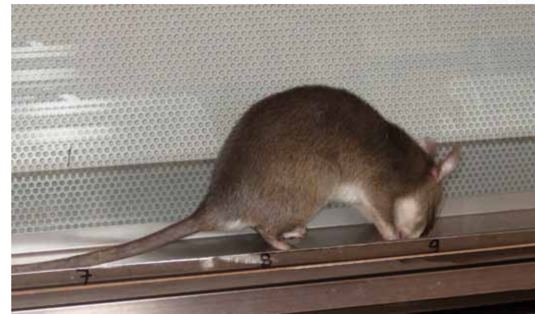
A pouched rat identifies a positive sample by pausing and scratching at a hole above an aluminum pot containing soil to which mine water has been added.

Preliminary results appeared quite promising in that pouched rats reliably indicated filters (by scratching at them) from APOPO's training minefield, but they did not indicate filters from other locations where mines were not present. When tested with positive samples from other locations where mines were present, however, the rats failed to indicate (missed) most of them. These results suggested that their training had failed to establish