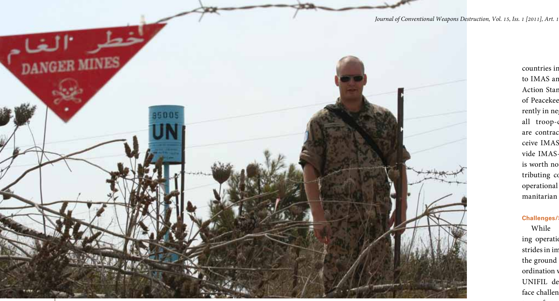
A Blue-Line barrel is completed and measured.

project in 2007 and joint tasks with the Swedish Rescue Services Agency and Chinese peacekeepers in 2009, as well as clearance of the LAF patrol road north of the Blue Line. The clearance and reconstruction of the LAF road was conducted by SRSA and UNIFIL in 2009. In 2010, UNIFIL and MAG (Mines Advisory Group) conducted joint operations on the LAF road north of the Blue Line. MAG provided mechanical and manual clearance and UNIFIL construction units (Italian and Portuguese) conducted road construction.