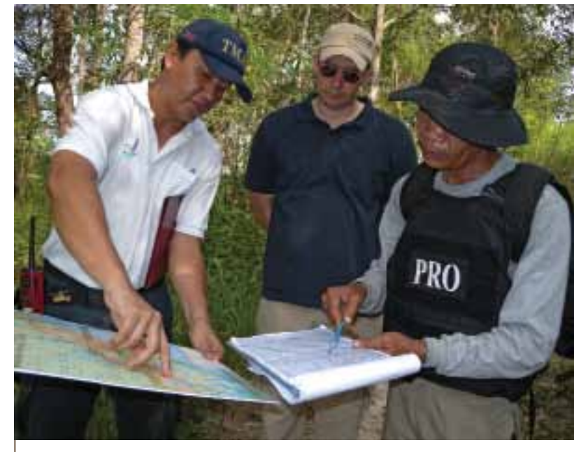
APOPO-PRO Non-techical Survey field discussions in Trat province. Small inaccuracies in data recording will have a major impact on the result. Quality training and regular monitoring of survey teams are key survey components.

The ground-coverage card is similar to the Non-technical Survey scorecard. By assessing the quality of the assets at collecting information during Technical Survey, developing a generic ground-coverage card is possible. If manual mine clearance is the best method and has the highest probability of finding a mine, a flail is slightly less suitable and has a lower probability of indicating whether or not mines