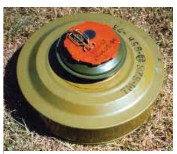
A TM-62 M Anti-Vehicle Mine typical of anti-tank mines found in Thailand.