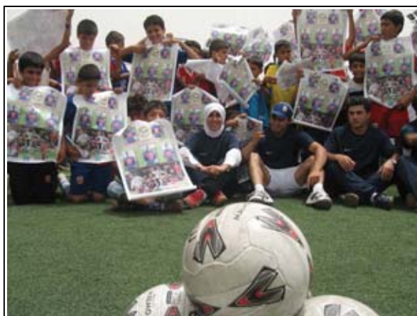
A female Spirit of Soccer coach sits with participants holding up MRE posters at a soccer training session in Kurdistan.

In 2008, Spirit of Soccer began work in Iraq and delivered programs in Baghdad, Basra and Kirkuk. In 2010, Spirit of Soccer, in partnership with the international football association ( Federation Internationale de Football Association ), the Jordanian Football Association, Generations for Peace and Jordan’s National Committee for Demining and Rehabilitation, implemented a regional Soccer/MRE course targeting coaches and children from mine/ERW-affected communities in Iraq, Jordan, Lebanon and the West Bank. This course trained 30 coaches and 64 children from the four mine-affected countries and at the end of the course, a tournament was held on National Mine Awareness Day.