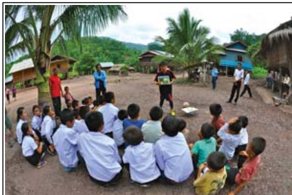
Spirit of Soccer coaches deliver MRE in Xieng Khouang province, Lao PDR, in March 2011.

the children cannot outrun a mine's blast. Another exercise involves asking the participants what qualities it takes to become a professional soccer player. The coaches then elaborate by saying that aside from needing talent and dedication, they also need their legs. Coaches use exercises to describe a landmine's impact. They kick a soccer ball typically 50–70 meters away and ask the participants to imagine that the ball is a mine or a bomb, illustrating that even at a distance it can still kill or maim.