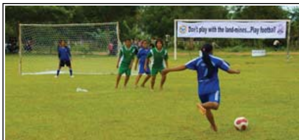
Girls take part in a Spirit of Soccer mine-risk education festival in Battambang province, Cambodia.

Spirit of Soccer began working in Bosnia and Herzegovina and Kosovo. In 2005, there were 875 mine/ERW casualties in Bosnia and Herzegovina reported by the Bosnia-Herzegovina Mine Action Center and 267 of those deaths were children. In 2006, there were no child deaths from mines/ERW, so it was decided the funding would be better spent in Cambodia. In 2005, Spirit of Soccer began operating in Battambang province, Cambodia, where it delivered coaching clinics in provinces along the Thai border, including the K5 mine belt, where forced laborers laid three million mines during the Khmer Rouge regime. 2