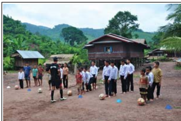
Each soccer game is designed to contain an MRE message and the soccer balls are printed with mine signs to aid recognition.